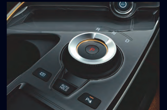
Shift By Wire Change gear position simply by turning the dial of Shift by Wire system left or right