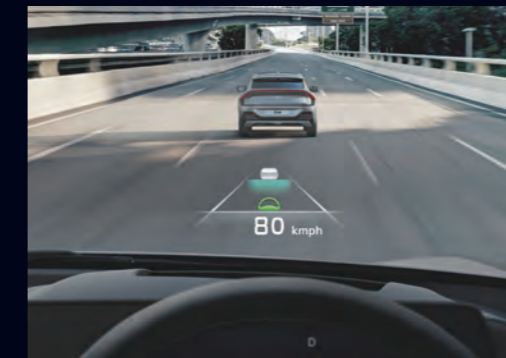
Augmented Reality Head-up Display Key information such as speed, lane safety indication, is projected in an intuitive manner on the windscreen

Let our technology handle the details, so you can stay connected to the journey. By prioritising information, the fully electric Kia EV6 lets you take in more of the world outside, and spend less time scanning screens and dials. This is what makes EV6 the most convenient electric vehicle on the streets.