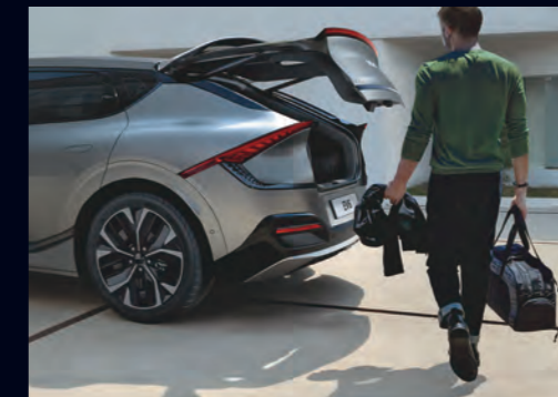
Smart Power Tailgate The power tailgate can be set to open automatically to a desired height