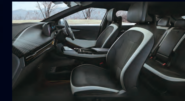
Black Interior - Black Suede Seats with Vegan Leather Bolsters