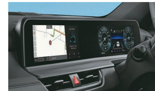
Intuitive 26.03 cm (10.25") HD Touchscreen Navigation + Full Digital Cluster with 26.04 cm (10.25") Color LCD MID