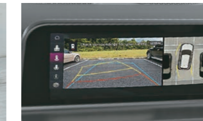
360° Camera with Blind View Monitor in Cluster