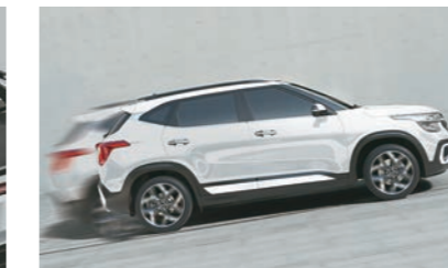
Electronic Stability Control (ESC), Hill Assist Control (HAC) & Vehicle Stability Management (VSM)