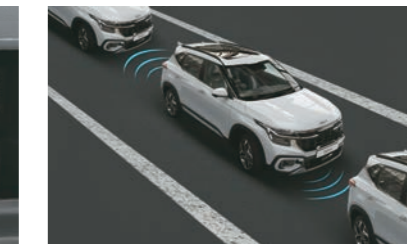
Attentive Front and Rear Parking Sensors