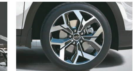
All Wheel Disc Brakes