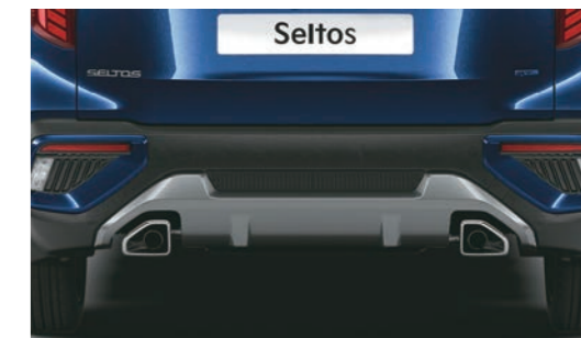
Stylish Dual Sport Exhaust (G1.5T Only)