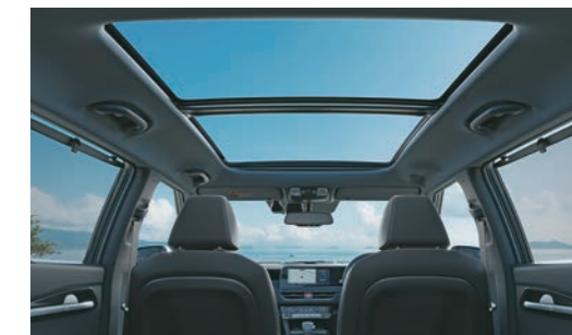
Awe-inspiring Dual Pane Panoramic Sunroof