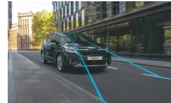
Lane Keep Assist (LKA)