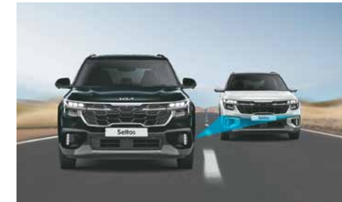
Blind Spot Collision Warning (BCW)