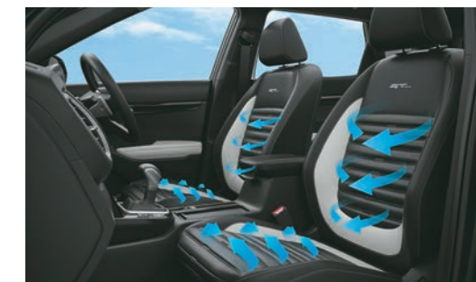
Comfortable Front Ventilated Seats with 8-way Power Driver's Seat

There's no better way to travel than in the new Seltos. The awe-inspiring new interiors are reimagined to look aesthetically stylish and edgy with generous space that offer you a supremely comfortable drive. With a whole new range of state-of-the-art features like the Electric Parking Brake, Smart Pure Air Purifier with virus and bacteria protection and Bose Premium Sound System with 8 Speakers, the new Seltos takes your driving comfort to the next level.