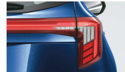
Distinctive Star Map LED Connected Tail Lamps