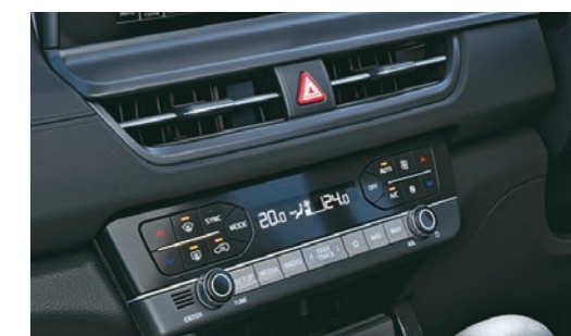
Intelligent Dual Zone Fully Automatic Air Conditioner