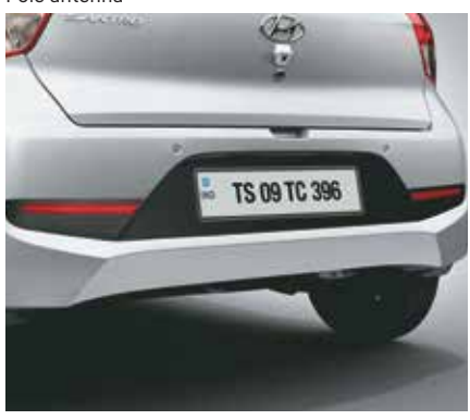
Dual tone body color bumpers with reflectors