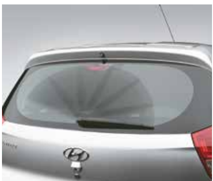
Rear washer & wiper