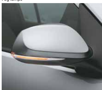
ORVM with electric adjustment & turn indicators