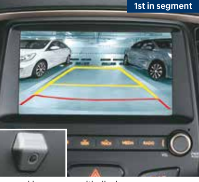
Rear parking camera with display on 17.64 cm (7") audio video screen