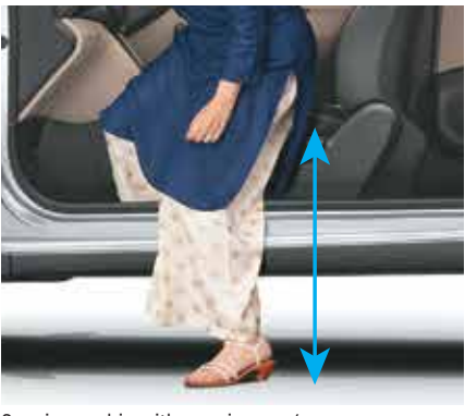
Spacious cabin with easy ingress/egress