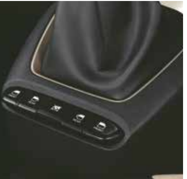
Ergonomically positioned power window switches