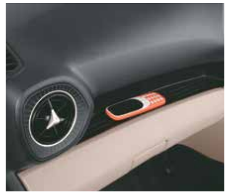
Practical storage area