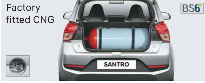
Convenient CNG filling (near petrol fill area)