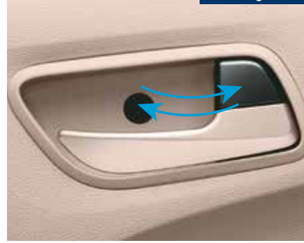
Speed sensing auto door lock & Impact sensing auto door unlock