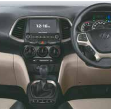
Elephant inspired unique centre fascia