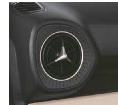
Unique propeller design air con vents