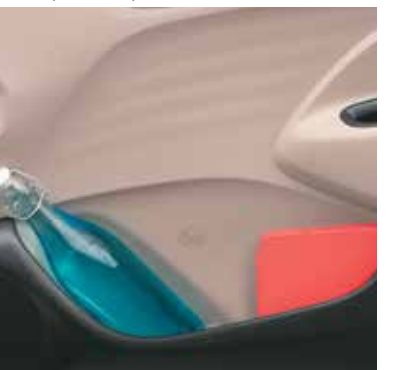
Map pocket with 1I bottle holder