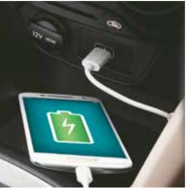
Power outlet & USB port

The Santro is thoughtfully designed for the comfort and convenience of your loved ones. Its ergonomically crafted interiors with champagne gold inserts and a host of features enhance the overall driving experience.