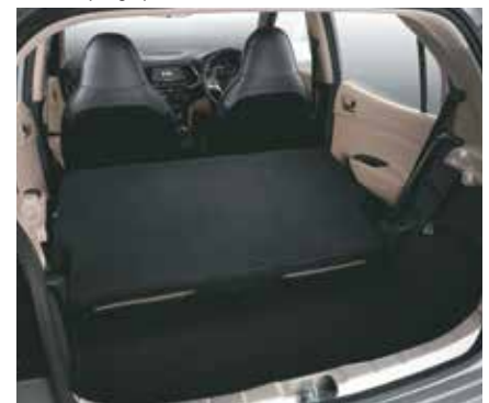
Rear seat bench folding