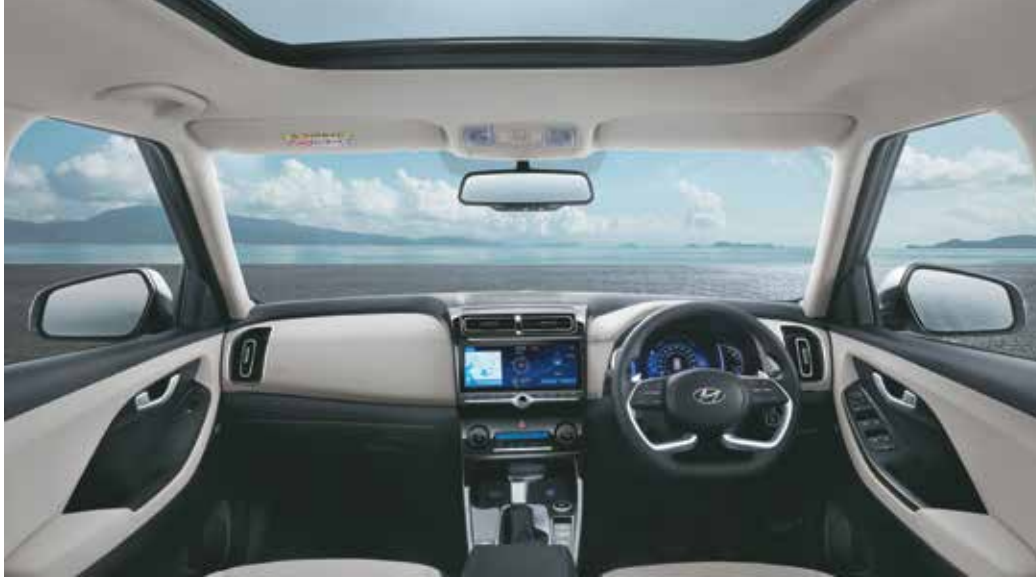
Two tone black & greige interiors - Available in standard CRETA