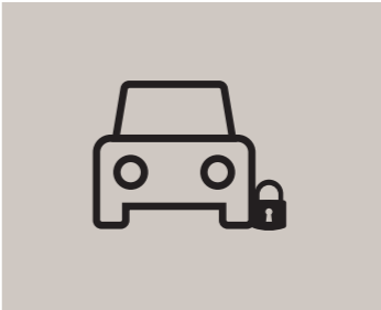
Stolen vehicle tracking, notification & immobilization*