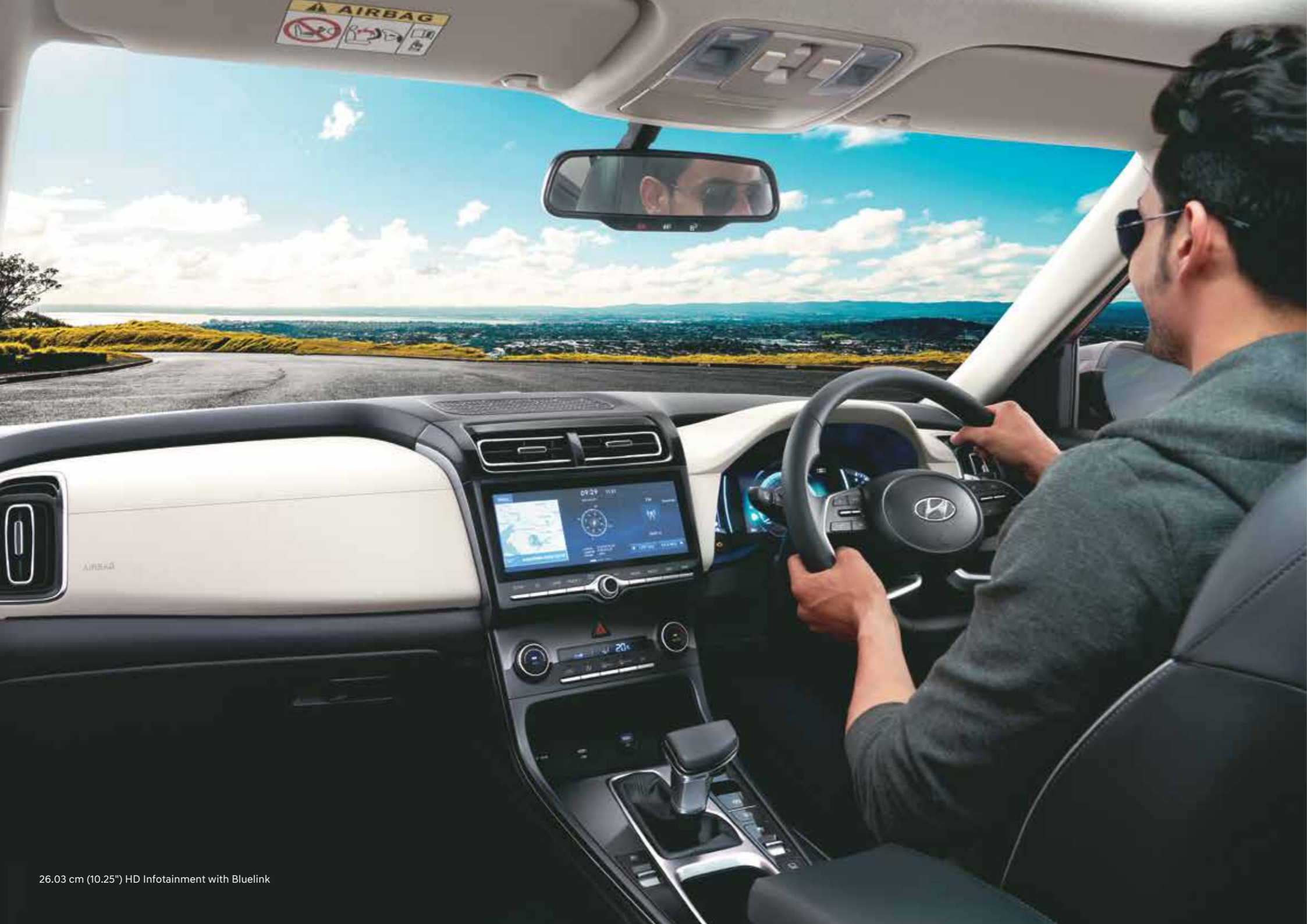
26.03 cm (10.25") HD Infotainment with Bluelink