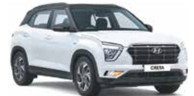
Polar white with phantom black roof*