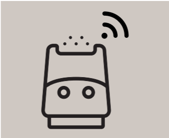
Remote air purifier on*