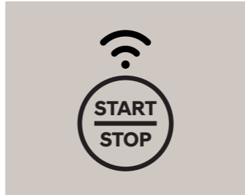
Remote engine start/stop (AT/DCT & MT)