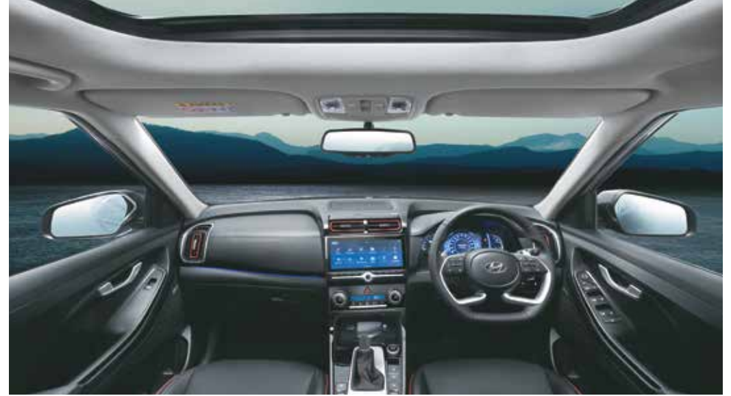
All-black interiors with coloured inserts - Available in Knight edition and turbo variants