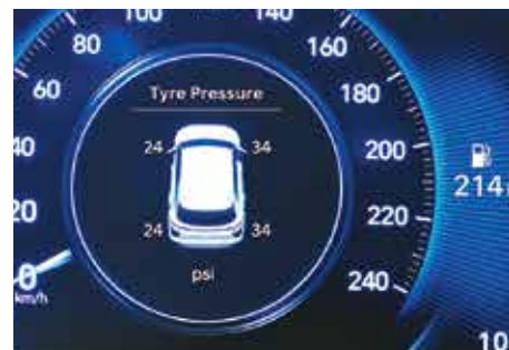
Tyre pressure monitoring system (TPMS)