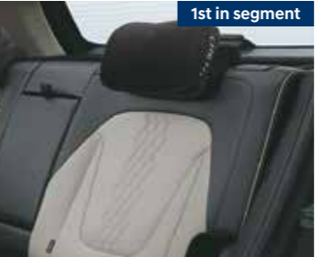
Rear seat headrest cushion