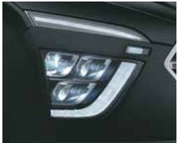
Trio beam LED headlamps with crescent glow LED DRLs