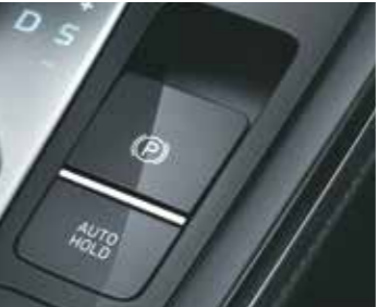
Electric parking brake with auto hold