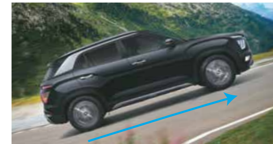
Hill start assist control (HAC)