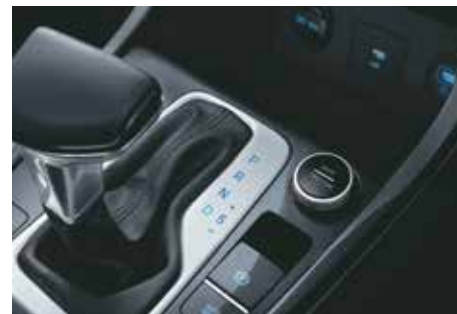
7-speed DCT, 6-speed automatic transmission & IVT