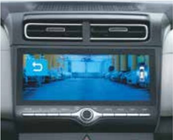
Driver rear view monitor

Savor the awe inspiring beauty all around when you get in the all-new Creta. The plush new interiors give you the advantage of extra comfort on every ride. Breathe in the wonders of nature and relish exquisite scenic views as you make your way across all-terrains of life.