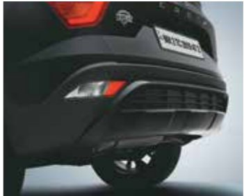
Black gloss front and rear skid plate