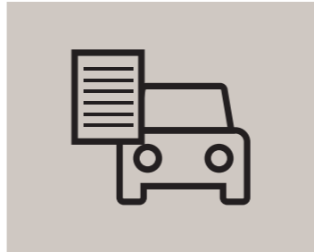
Monthly health report