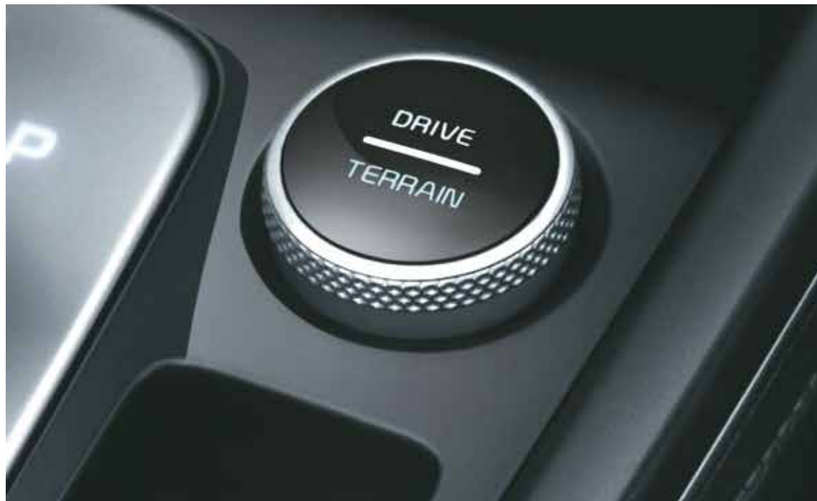
Traction control mode (snow, sand, mud)

With the new 1.4l petrol, 1.5l petrol and 1.5l diesel BS6 engines under the hood, the all-new Creta delivers a power packed performance on every terrain. Be it on the road or off it, the all-new Creta has the dynamism to go the distance.