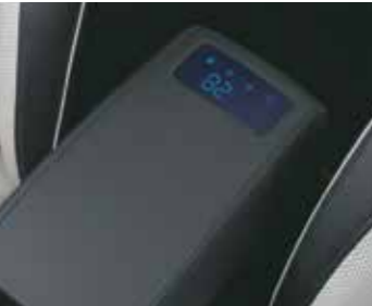
Auto healthy air purifier

Other features: Leather wrapped D-cut steering wheel | Leather TGS knob | Automatic headlamps | Smartphone wireless charger | Electro chromic mirror (ECM) | Door scuff plates – metallic | Rear window sunshade | Power driver seat - 8 way | Cruise control | 60:40 split rear seat | 2-step reclining rear seat