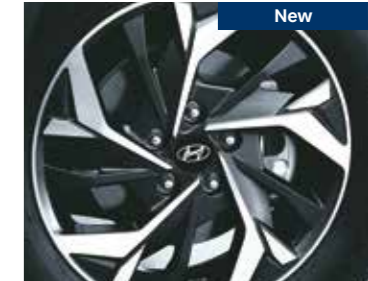
Rear disc brakes