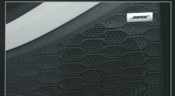
Bose premium sound system (8 speakers)