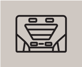
Voice operated open/close sunroof*