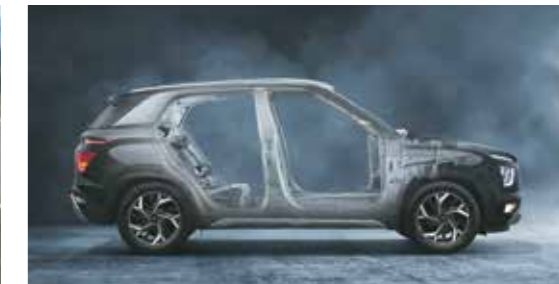
Strong body structure with AHSS