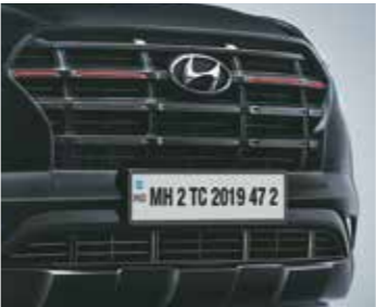
Black gloss radiator grille with red insert

With a breathtakingly beautiful and edgy design, the all-new Creta has been crafted to command respect. The bold exterior and the new masculine stance will set you apart from every other SUV on the road. No matter where you decide to go, the all-new Creta will help you stay one step ahead on the road.