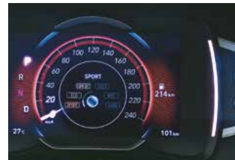
Drive mode select (eco, comfort & sport)