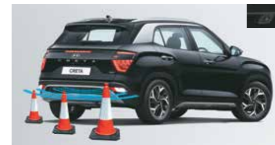
Rear parking sensors with camera