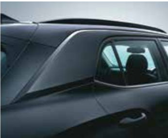
Black gloss C-pillar garnish