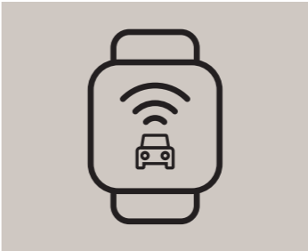
Connected car features in smart watch app*