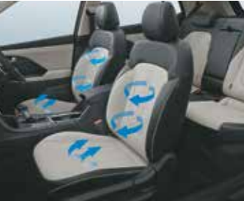
Front row ventilated seats