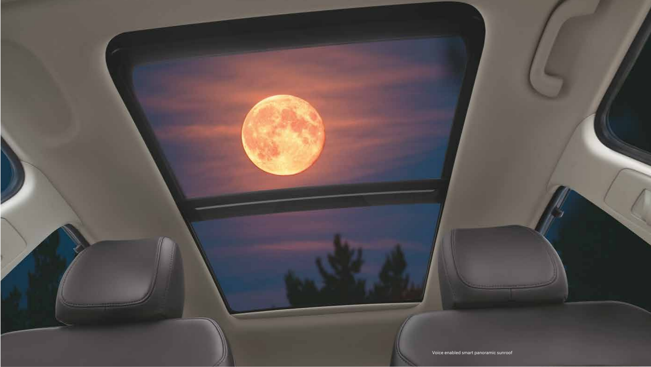
Voice enabled smart panoramic sunroof