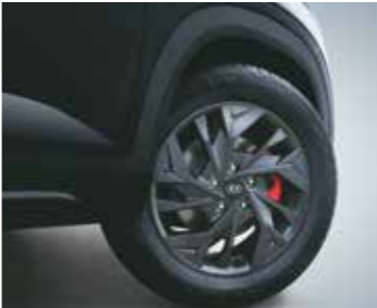
Red front brake callipers