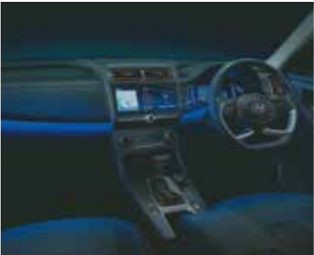
Soothing blue ambient lighting