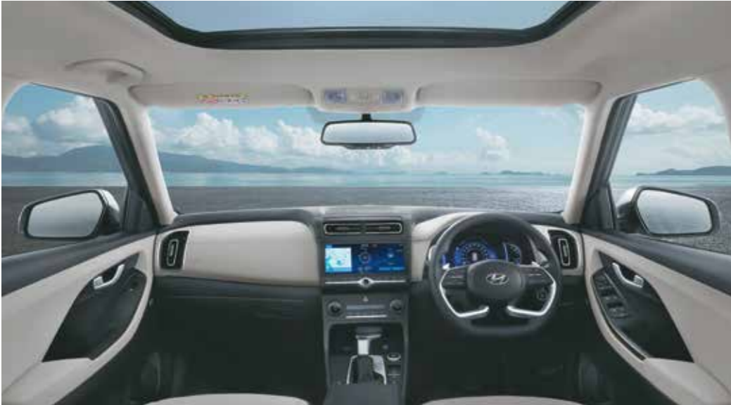
Two tone black & greige interiors