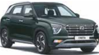
Deep forest (single tone)

*Turbo trims available in single tone polar white & phantom black also.*