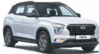
Polar white with phantom black roof