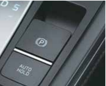
Electric parking brake with auto hold