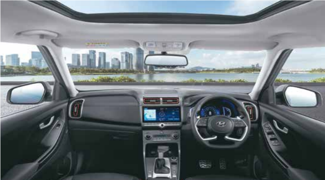
All black interiors with orange colour pack