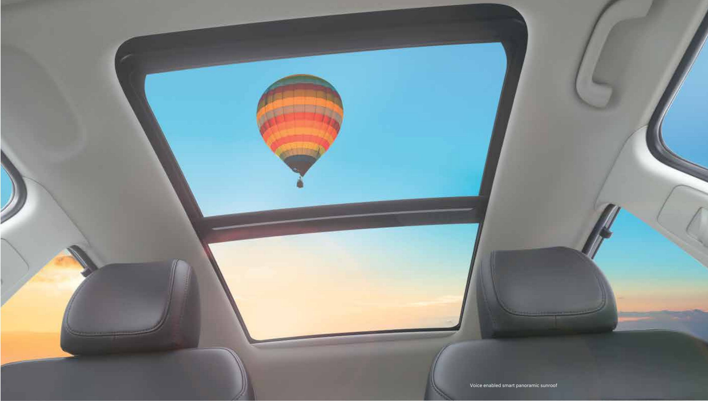
Voice enabled smart panoramic sunroof