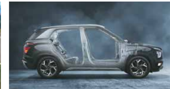
Strong body structure with AHSS