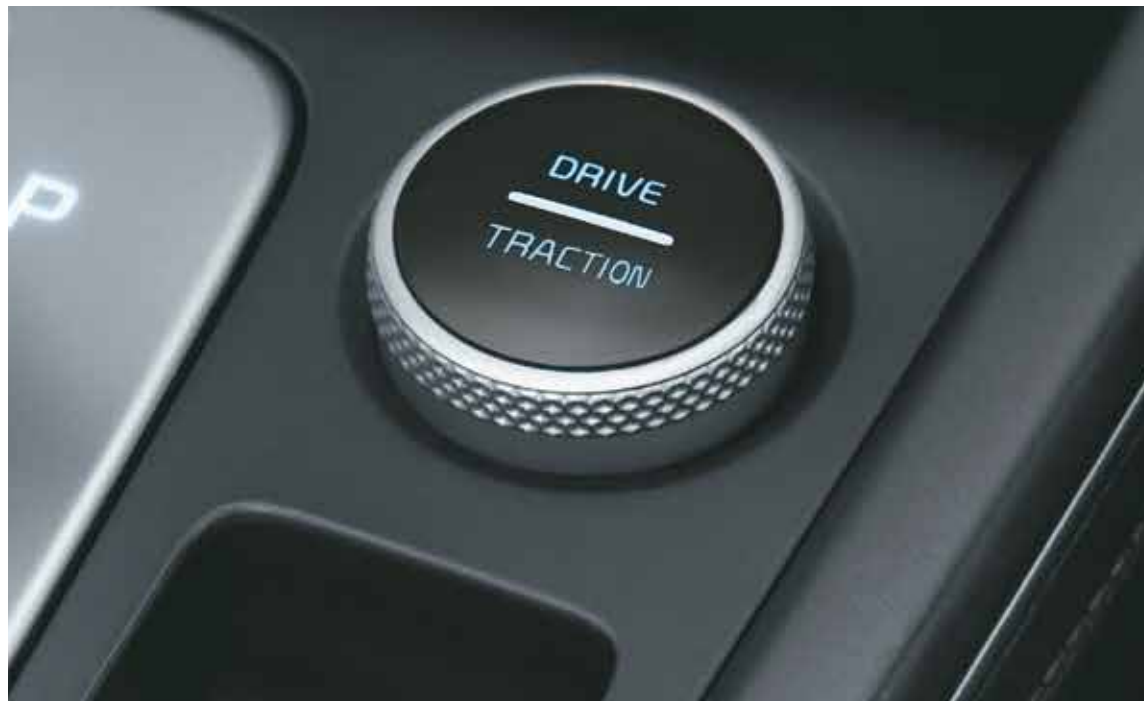
Traction control mode (snow, sand, mud)

With the new 1.4l petrol, 1.5l petrol and 1.5l diesel BS6 engines under the hood, the all-new Creta delivers a power packed performance on every terrain. Be it on the road or off it, the all-new Creta has the dynamism to go the distance.