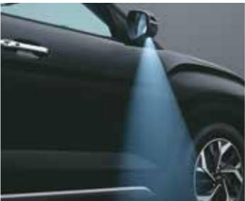
Welcome function with auto unfold ORVMs & puddle lamps