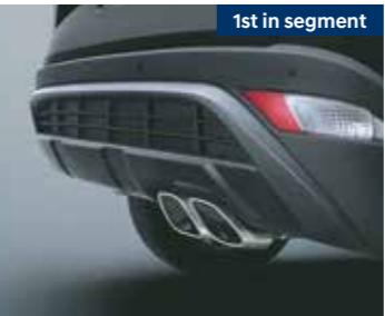
Twin tip exhaust (turbo only)