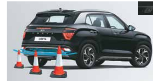
Rear parking sensors with camera