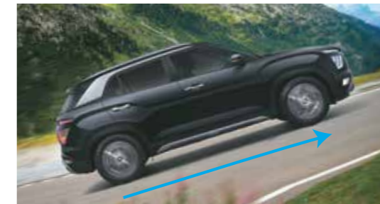
Hill start assist control (HAC)