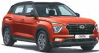
Lava orange with phantom black roof