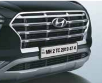
Signature cascading grille

With a breathtakingly beautiful and edgy design, the all-new Creta has been crafted to command respect. The bold exterior and the new masculine stance will set you apart from every other SUV on the road. No matter where you decide to go, the all-new Creta will help you stay one step ahead on the road.