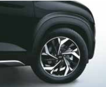
R17 (D=436.6 mm) diamond cut alloys