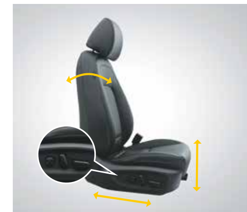
10-way power driver seat with lumbar support