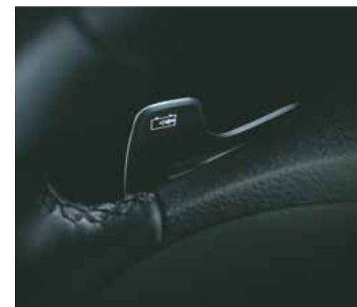
One pedal driving