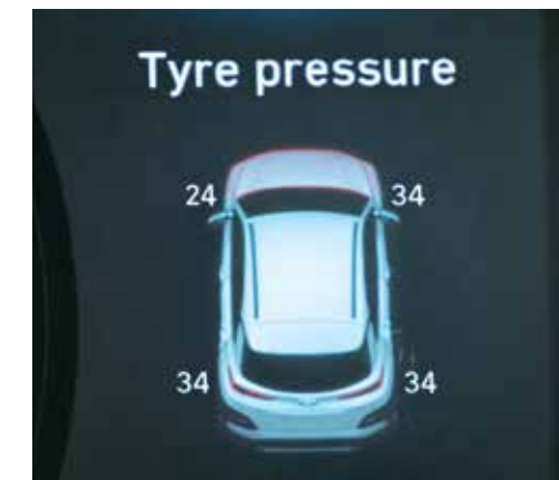
Tyre pressure monitoring system (high line)