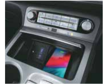
Wireless phone charger