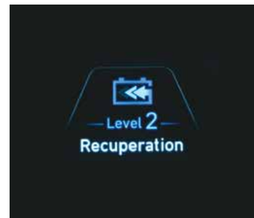
Paddle shifters (for regenerative braking)