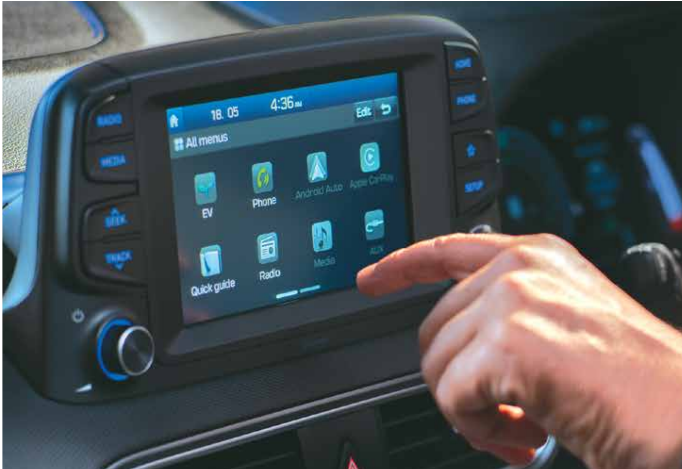
17.77cm (7") Touchscreen Display Audio with Android Auto and Apple CarPlay screen

Get ready for a hassle-free life with 2022 Hyundai Kona Electric that has been created to fit in your world seamlessly. Now you can access your phone, your favourite music and maps, using the multimedia touchscreen display that comes with Apple CarPlay and Android Auto compatibility. To ensure your phone never runs out of battery, there is a wireless charging pad.