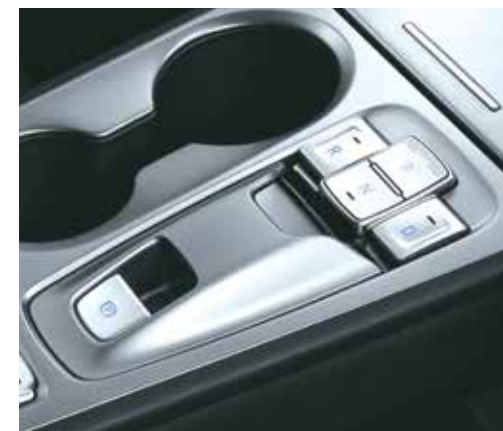
Shift-by-wire automatic transmission and electric parking brake

The second you get into 2022 Hyundai Kona Electric, you enter the heart of unmatched comfort. Intelligently placed button type shift-by-wire system, impeccably designed bridge-type centre console; everything has been designed and positioned to make your driving experience as smooth as possible.