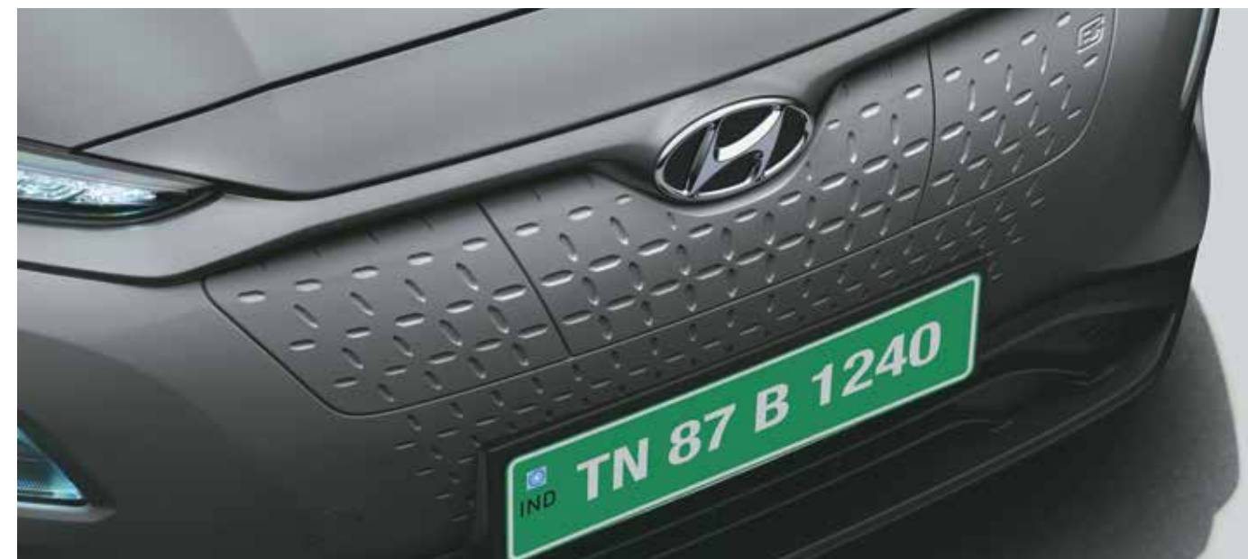
Modern, clean & integrated front grille design optimized for superior aerodynamics