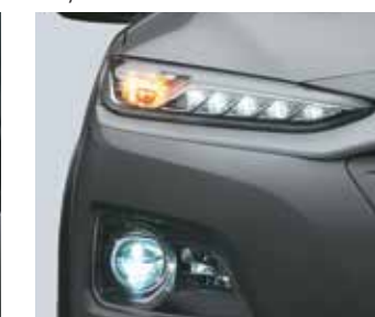
Distinctive split type LED headlamps with LED DRLs

Other features: Roof rails | Body color ORVM with turn indicators | Body colour door handles | Dual tone roof (option) | Smart electric sunroof with safety | Side sill molding – black