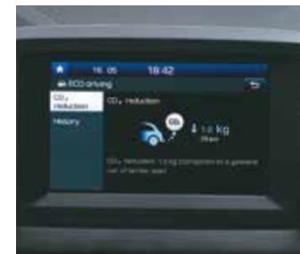
ECO driving information