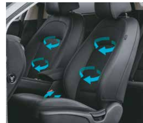
Front ventilated and heated seats