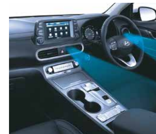
Option of driver only air conditioning

Other features: Bridge-type centre console | Leather wrapped steering wheel | LED luggage lamp Leather seats | Rear adjustable headrests | Rear split seats 60:40 | Soft touch dashboard