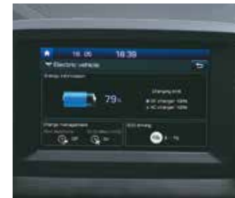
EV menu screens