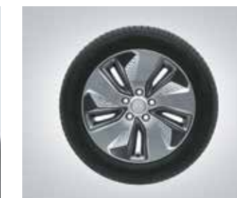
R17 (D=436.6 mm) EV exclusive alloy wheels