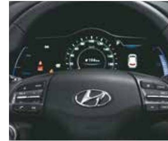
Digital instrument cluster with supervision