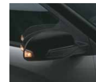
ORVM (heated) with electric adjust and folding