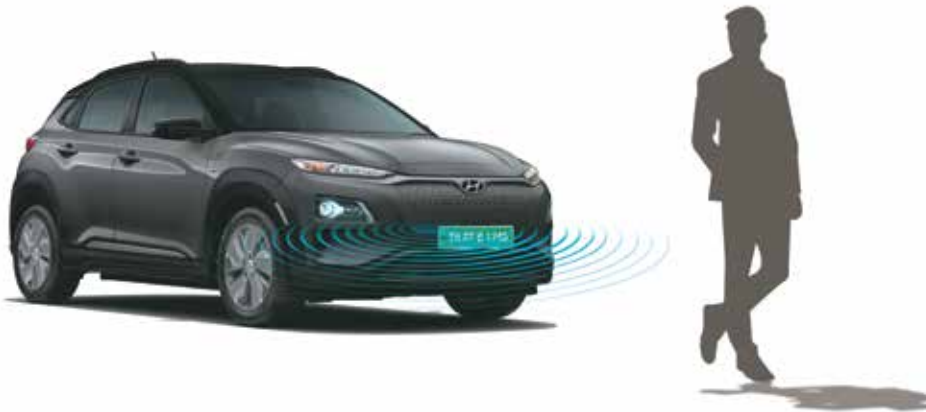
Virtual engine sound system When the vehicle is in motion, VESS generates an engine sound to ensure pedestrian safety