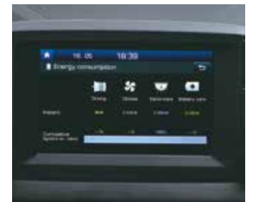
Power consumption information