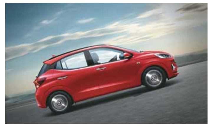
Hill-start assist control (HAC)