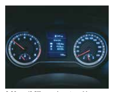
8.89 cm (3.5") speedometer with multi info display