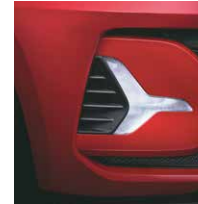
LED daytime running lamps (DRLs)