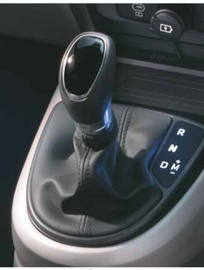
Automated manual transmission (AMT)