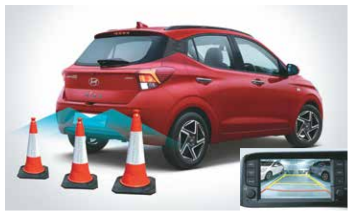
Rear parking camera with display on audio