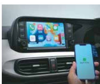
Apple CarPlay and Android Auto