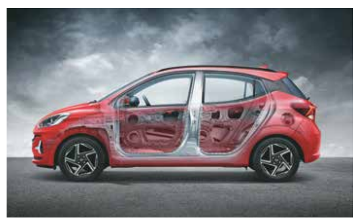
Strong built structure