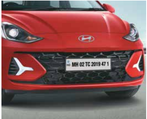
Painted black radiator grille

Style meets sophistication in the new Grand i10 NIOS. The new painted black radiator grille and LED daytime running lamps (DRLs) give it that refreshing new look. The new R15 (D=380.2 mm) diamond cut alloy wheels project an agile stance. And the new tail gate design with LED tail lamps defines its sharp rear profile, giving the new Grand i10 NIOS an unmistakably unique identity.