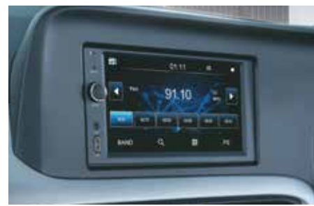
17.14cm (6.75") touchscreen display audio

Other features: 3 Point seat belts (All seats) (Best in segment) | Seat belt reminder (All seats) (Best in segment) | Headlamp escort system Burglar alarm | TPMS - highline | 6 Airbags