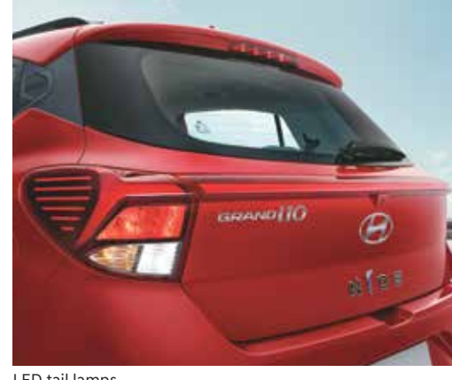
LED tail lamps