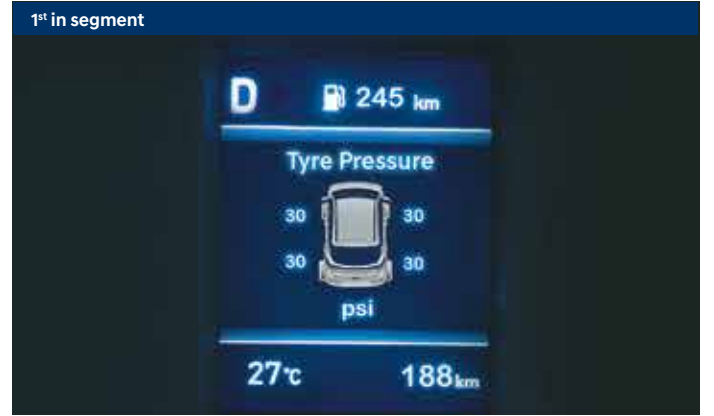
Tyre pressure monitoring system (TPMS) - highline

features. It features 6 airbags with side and curtain for added safety of all occupants. DVRM (Driver rear view monitor), Electronic Stability Control (ESC), Vehicle Stability Management (VSM) and Hill-start assist control (HAC) give you the confidence to drive freely.