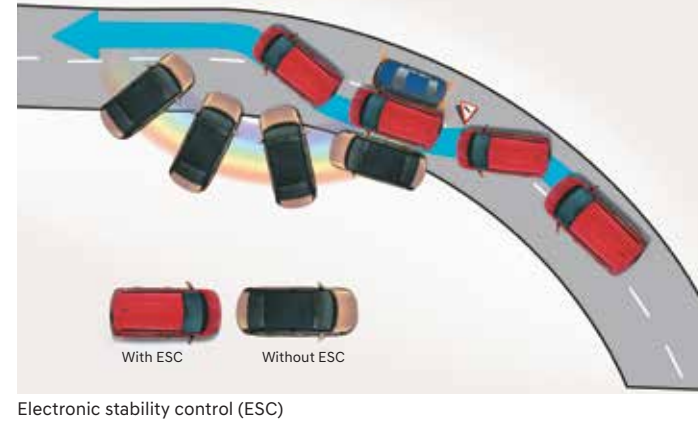
Electronic stability control (ESC) Vehicle stability management (VSM)