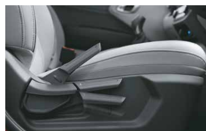
Driver seat height adjuster