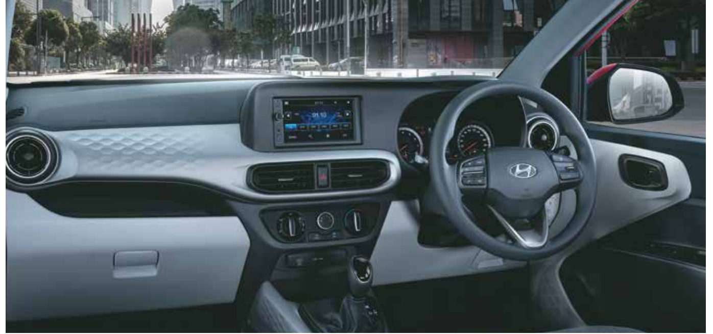
Dual tone grey interiors

Take control of your commute with the Grand i10 Nios corporate trim. Meticulously crafted to enhance your drive while exuding an executive presence. Experience the seamless convergence of technology and design that features a monochromatic black interior punctuated by strategically placed red accents, and gleaming chrome details.