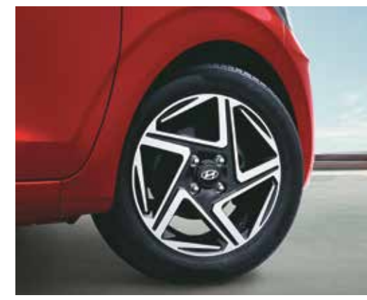
R15 (D=380.2 mm) diamond cut alloy wheels