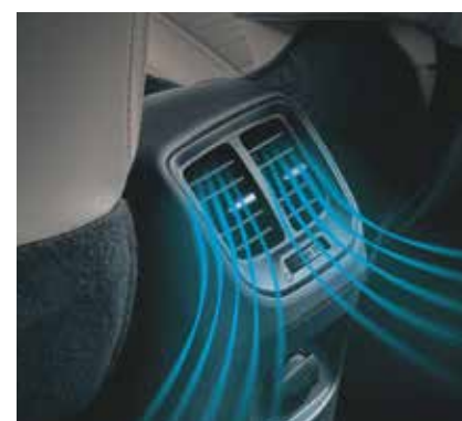
Rear AC vent