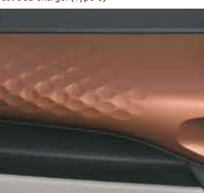
Premium honeycomb patterned crashpad