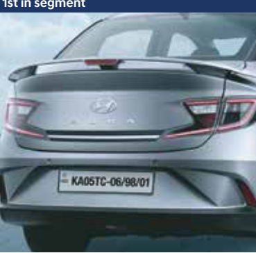
Rear wing spoiler