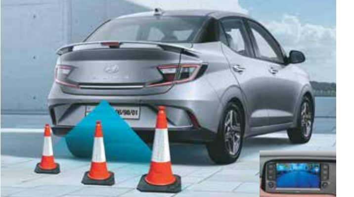
Rear parking camera with display on audio