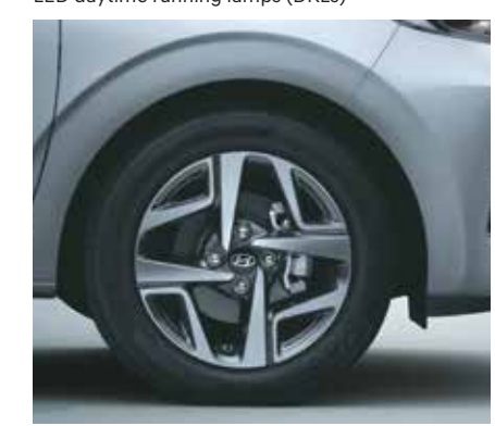
R15 (D = 380.2 mm) Diamond cut alloy wheels