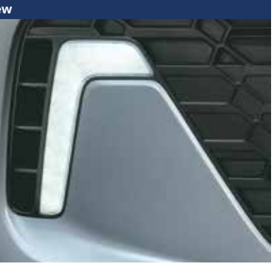
LED daytime running lamps (DRLs)