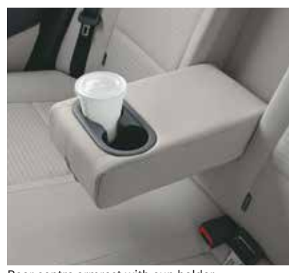
Rear centre armrest with cup holder