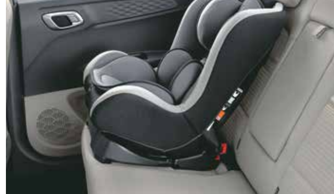
Child seat anchor (ISOFIX)