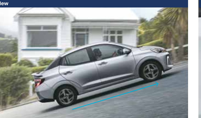
Hill-start assist control (HAC)