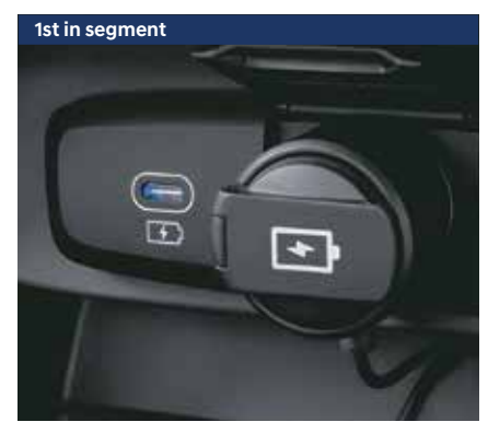
Fast USB charger (Type C)

The interior of the new Hyundai AURA combines modern aesthetics with contemporary craftsmanship. It is meticulously designed to optimise the space to give the occupants more room and make long journeys as comfortable as short hops across the city.