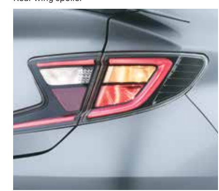
Stylish Z shaped LED tail lamps