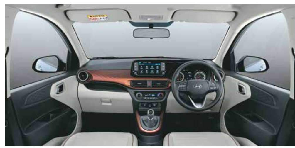
Dual tone grey interior