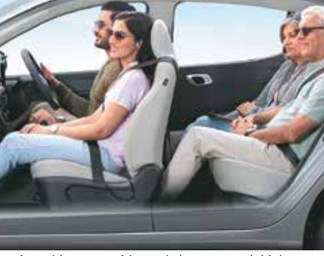
Superior cabin space with ample legroom and thigh support