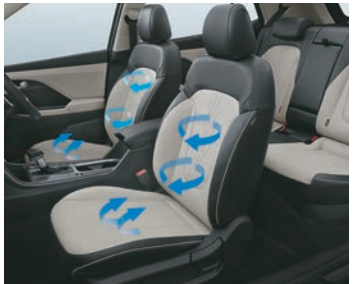
Front row ventilated seats