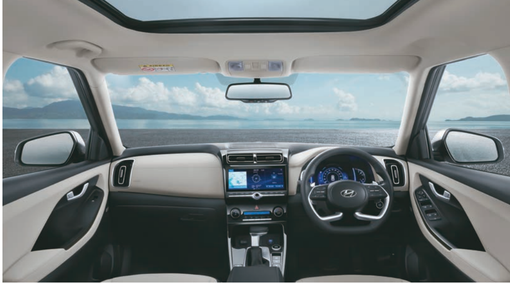
Two tone black & greige interiors - Available in standard CRETA