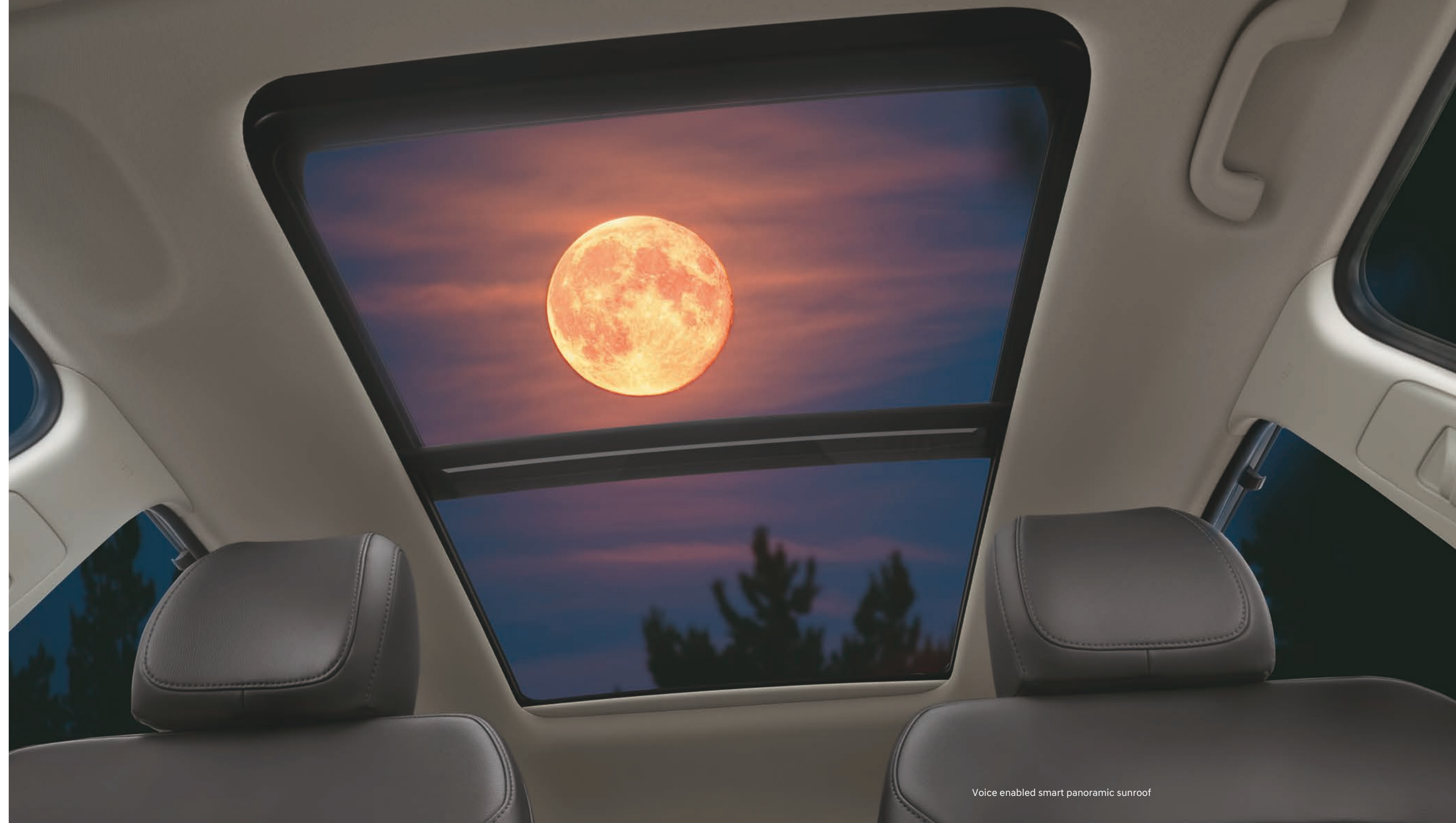
Voice enabled smart panoramic sunroof