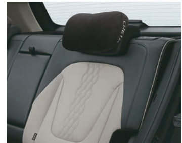
Rear seat headrest cushion