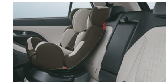
Child seat anchor (ISOFIX)