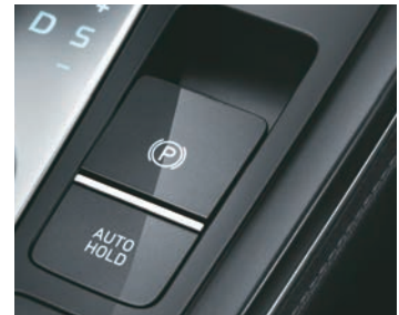
Electric parking brake with auto hold