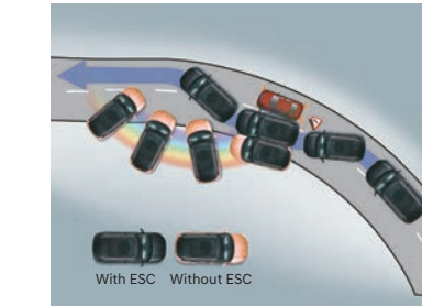
Electronic stability control (ESC)

The strong body structure with redefined standards of safety, ensure a secure drive for you and your family every time you hit the road.