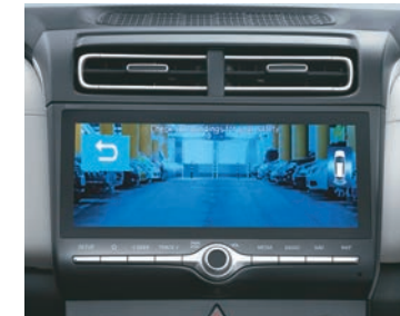
Driver rear view monitor

Savor the awe inspiring beauty all around when you get in Hyundai CRETA. The plush new interiors give you the advantage of extra comfort on every ride. Breathe in the wonders of nature and relish exquisite scenic views as you make your way across all-terrains of life.