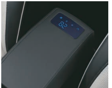
Auto healthy air purifier

Other features: Leather wrapped D-cut steering wheel | Leather TGS knob | Automatic headlamps | Smartphone wireless charger | Electro chromic mirror (ECM) | Door scuff plates – metallic | Rear window sunshade | Power driver seat – 8 way | Cruise control | 60:40 split rear seat | 2-step reclining rear seat