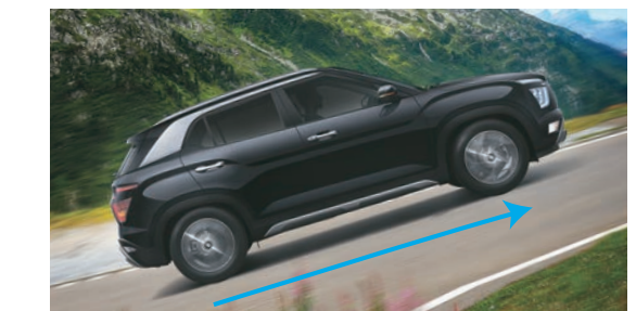
Hill start assist control (HAC)