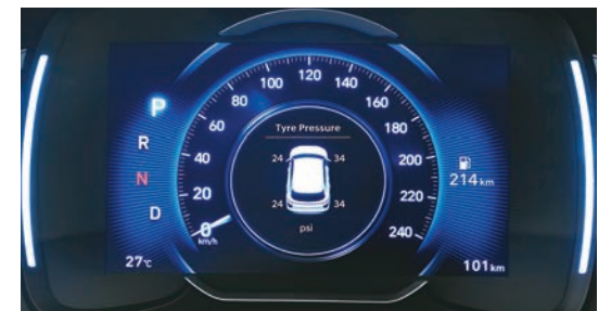
Tyre pressure monitoring system: Highline

Other standard safety features: Rear parking sensors | Speed alert system | Impact sensing auto door unlock Speed sensing auto door lock | ESS Other optional safety features: Rear camera with steering adaptive parking guidelines | Rear defogger with timer