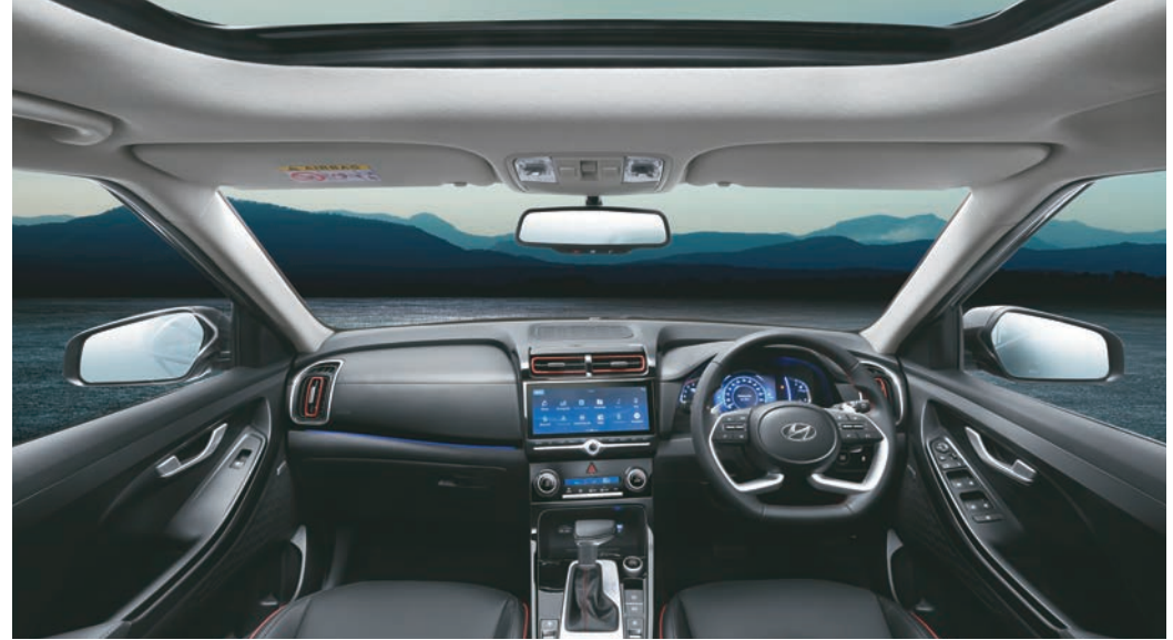
All-black interiors with coloured inserts - Available in Knight edition