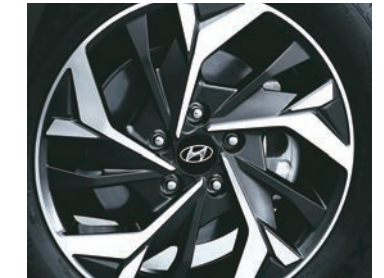
All wheel disc brakes