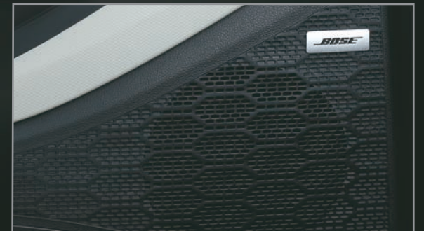
Bose premium sound system (8 speakers)