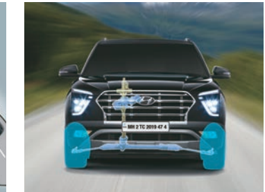
Vehicle stability management (VSM)