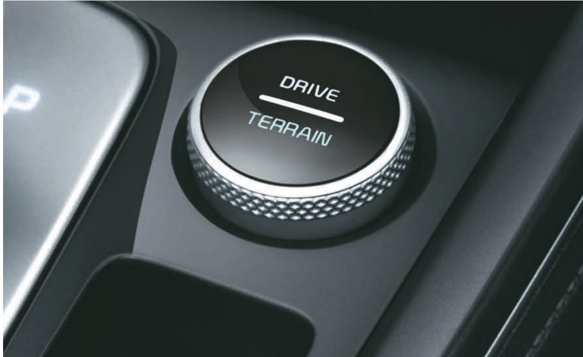
Traction control mode (snow, sand, mud)

With the 1.5l petrol and 1.5l diesel BS6 engines under the hood, Hyundai CRETA delivers a power packed performance on every terrain. Be it on the road or off it, Hyundai CRETA has the dynamism to go the distance.