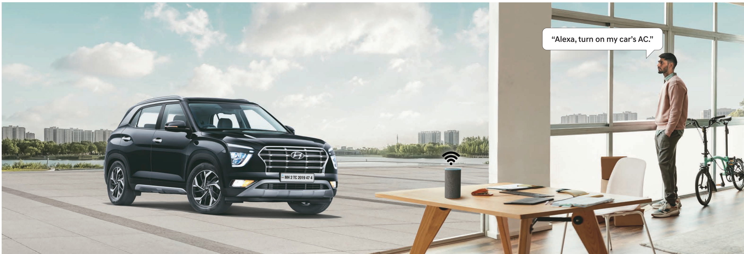
Home-to-car (H2C) with Alexa & Google Voice Assistant^