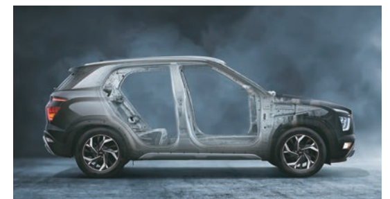
Strong body structure with AHSS