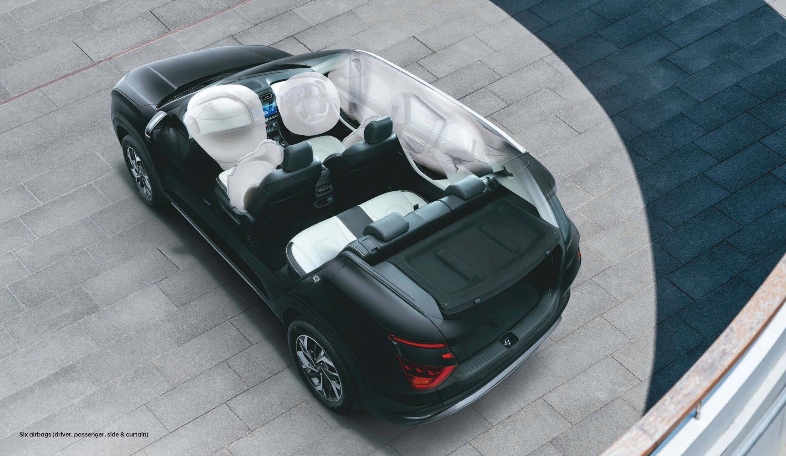
Six airbags (driver, passenger, side & curtain)