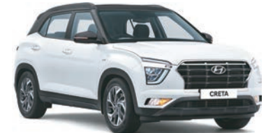
Polar white with phantom black roof