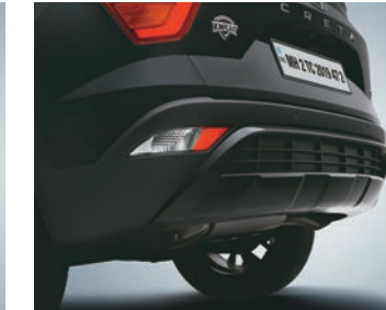
Black gloss front and rear skid plate