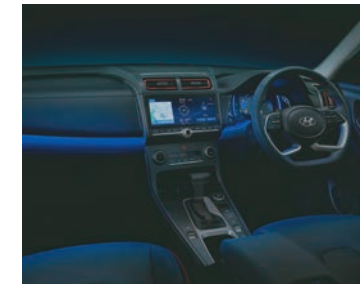
Soothing blue ambient lighting