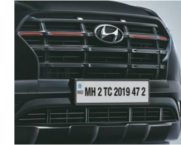
Black gloss radiator grille with red insert

With a breathtakingly beautiful and edgy design, Hyundai CRETA has been crafted to command respect. The bold exterior and the new masculine stance will set you apart from every other SUV on the road. No matter where you decide to go, Hyundai CRETA will help you stay one step ahead on the road.