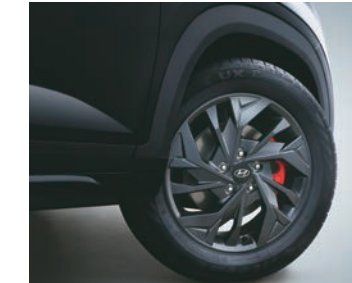
Red front brake callipers