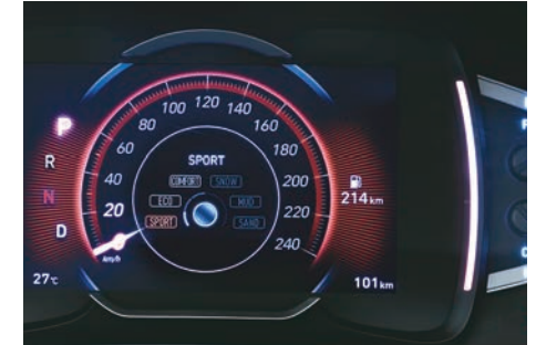
Drive mode select (eco, comfort & sport)