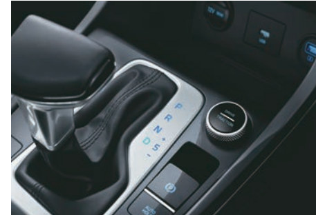
6-speed automatic transmission & IVT