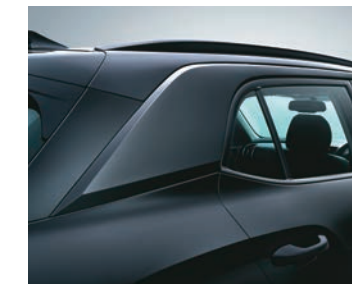
Black gloss C-pillar garnish