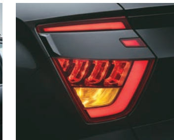
LED tail lamps