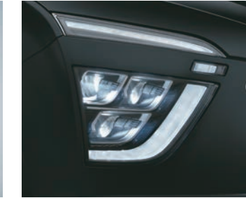
Trio beam LED headlamps with crescent glow LED DRLs