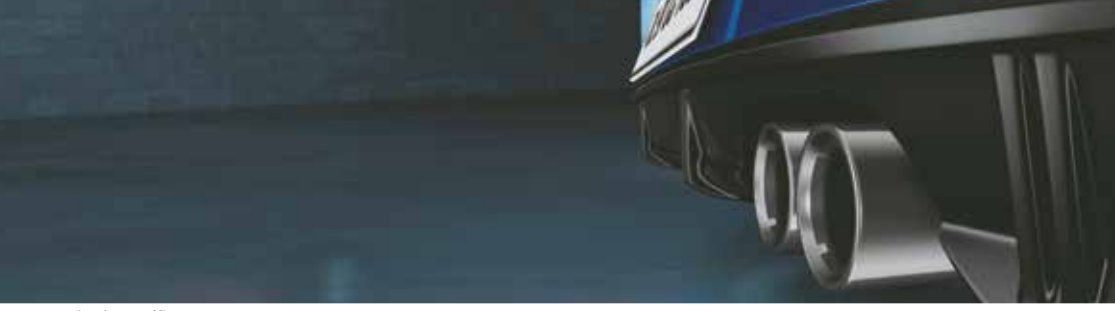
Sporty twin tip muffler