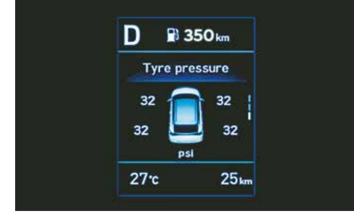
Tyre pressure monitoring system (highline)