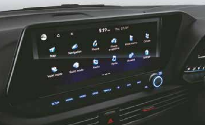
26.03 cm (10.25 ) HD touchscreen infotainment & navigation system

Connectivity comes easy in the new Hyundai i20 N Line. Equipped with cutting edge technology like home-to-car (H2C) with Alexa, fully automated temperature control, advanced infotainment with multilingual user interface, you've got the world at your fingertips.