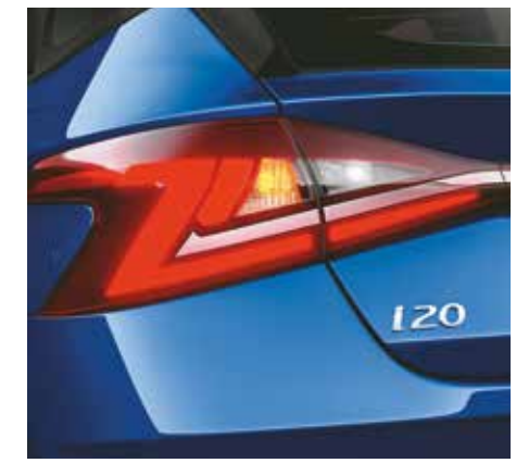
Z-shaped LED tail lamps