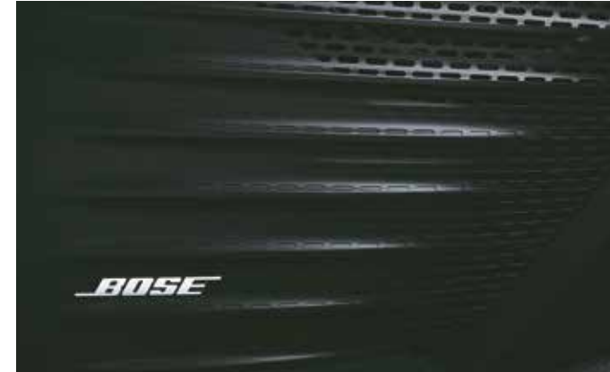
Bose premium 7 speaker system