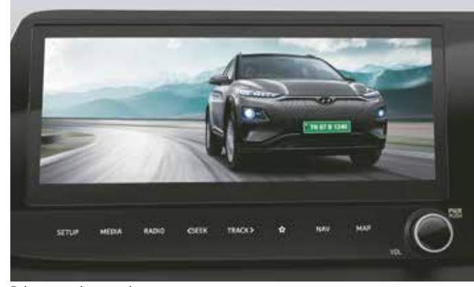
Driver rear view monitor system

Other features: ISOFIX | Emergency stop signal (ESS) | Rear parking sensors with display on infotainment