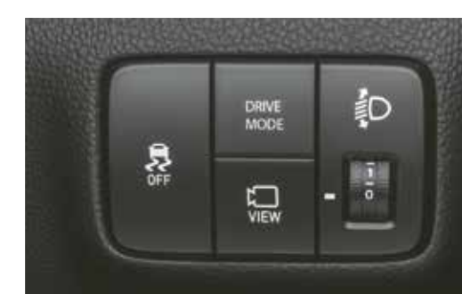
Drive mode select