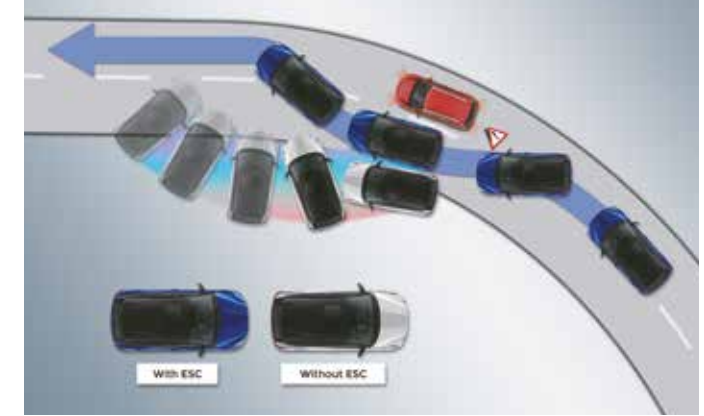
Electronic stability control (ESC) & Vehicle stability management (VSM)