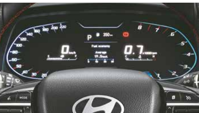
Digital cluster with IFI multi information display

Other features: Perforated leather wrapped gear knob with N logo | Sliding front armrest | Sporty metal pedals Dark metal finish inside door handles | Fast USB charger (Type C)