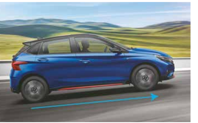
Hill-start assist control (HAC)