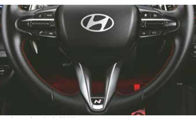
3-spoke steering wheel with N logo