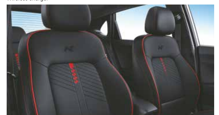
Chequered flag design leather seats with N logo