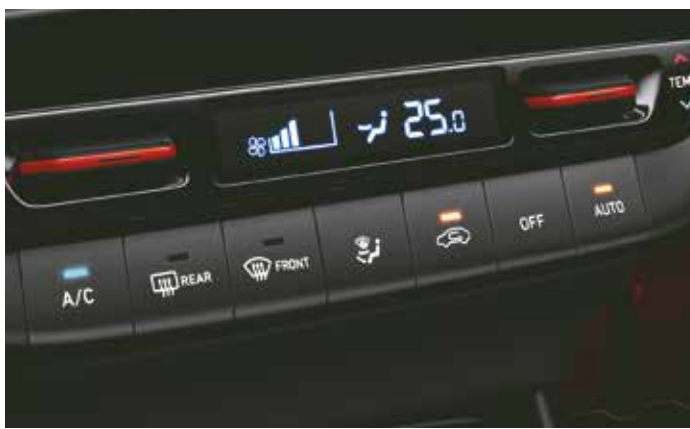
FATC with digital display

Other features: Smart entry with push button start/stop