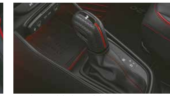
7 speed DCT (Dual clutch transmission)