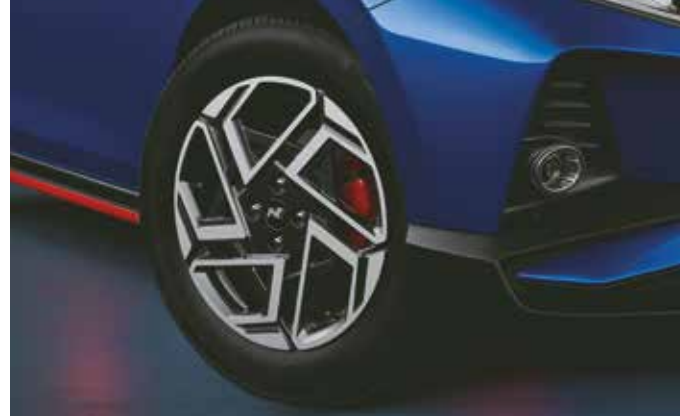
Front and rear disc brakes