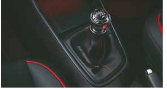
6-speed MT (Manual transmission)