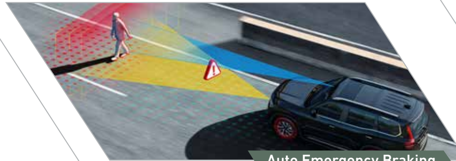
Auto Emergency Braking

Forward Collision Warning (FCW) warns you of imminent collision with vehicles and pedestrians.