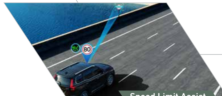
Speed Limit Assist

The Lane Departure Warning (LDW) system offers visual, audio, and haptic alerts to the driver whenever the car is going out of its lane on either side with/without driver input.