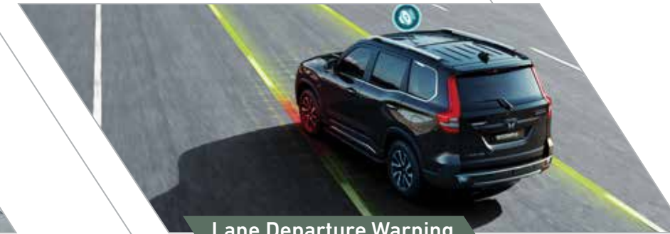
Lane Departure Warning

Automatic Emergency Braking (AEB) constantly scans the surroundings. It detects potential collision situations involving vehicles, cyclists, and pedestrians.