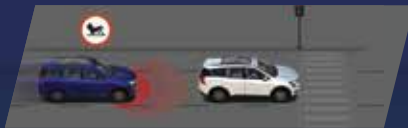
AUTOMATIC EMERGENCY BRAKING