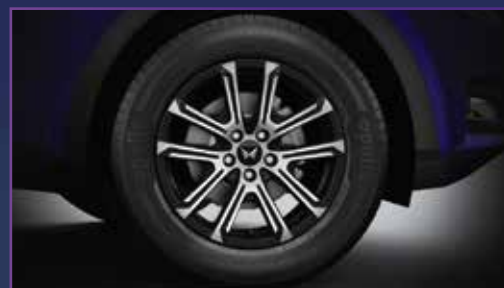
R18 DIAMOND-CUT ALLOY WHEELS