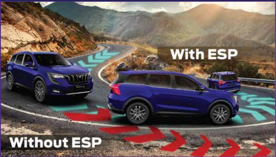
LATEST-GEN ELECTRONIC STABILITY PROGRAM

DRIVER DROWSINESS DETECTION • AUTO BOOSTER HEADLAMPS PERSONALIZED SAFETY ALERTS • ELECTRONIC PARK BRAKE