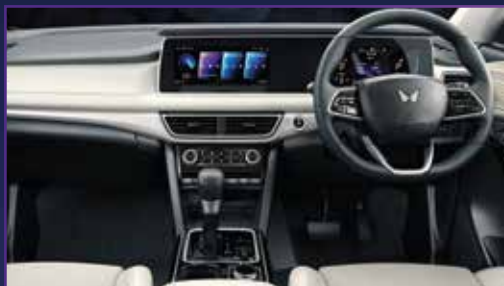
LUXURIOUS AND SOPHISTICATED INTERIORS

The Adrenox powered XUV700 is effortlessly impressive. From the style lines to the bold SUV stance, just one look is enough to get heads turning. Add the Skyroof™ and distinct LED cabin lights, and you've got an SUV that can't be ignored.