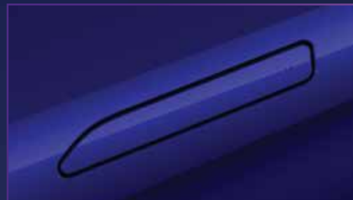
SMART DOOR HANDLES