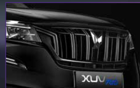
ALL-NEW BLACK FRONT GRILLE

The 2024 XUV700 screams exclusivity. The unmistakable Stealth Black finish exudes refined luxury, while cutting-edge technology effortlessly elevates the driving experience. The 2024 XUV700 is not just a symbol of elegance but a harmonious fusion of both style and innovation.