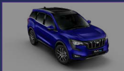
DUAL TONE BLACK ROOF