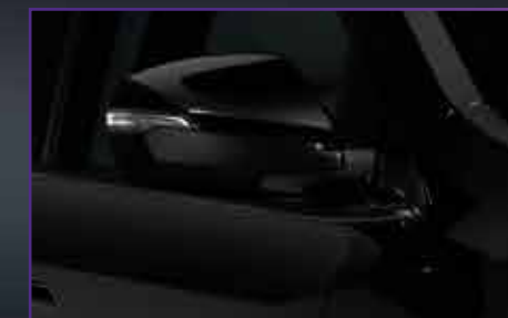
FIRST-IN-SEGMENT MEMORY ORVMs LINKED TO THE SEAT PROFILES