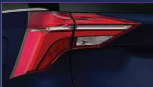
CAPTIVATING ARROW-HEAD LED TAILLAMPS