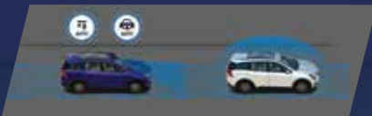
SMART PILOT ASSIST

HERE'S HOW ADAS PROTECTS YOUR XUV700 ON EVERY DRIVE: