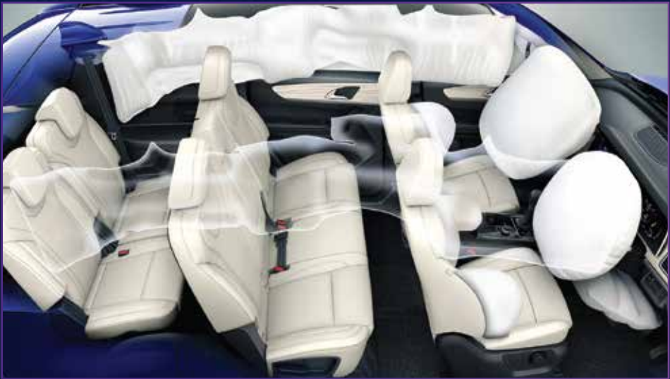
BEST-IN-CLASS 7 AIRBAG SAFETY

The Advanced Driver Assistance Systems make the XUV700 an impenetrable fortress. With radar and a camera that detect obstacles, avoid collisions and assist the driver, there's no place as safe or exciting on the road as this.