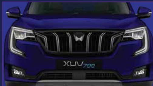
STRIKING CLEAR-VIEW LED HEADLAMPS WITH DRL AND SEQUENTIAL TURN INDICATOR