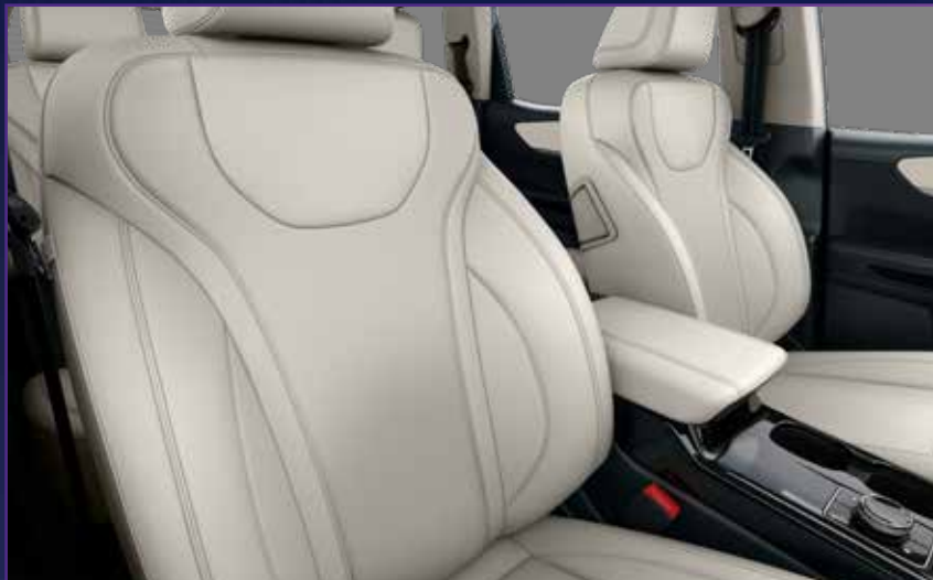
ALL-NEW FRONT VENTILATED SEATS