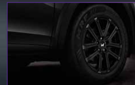
ALL-NEW BLACK ALLOY WHEELS