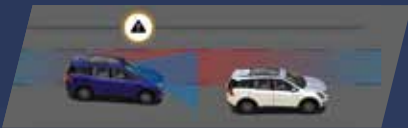
LANE KEEP ASSIST