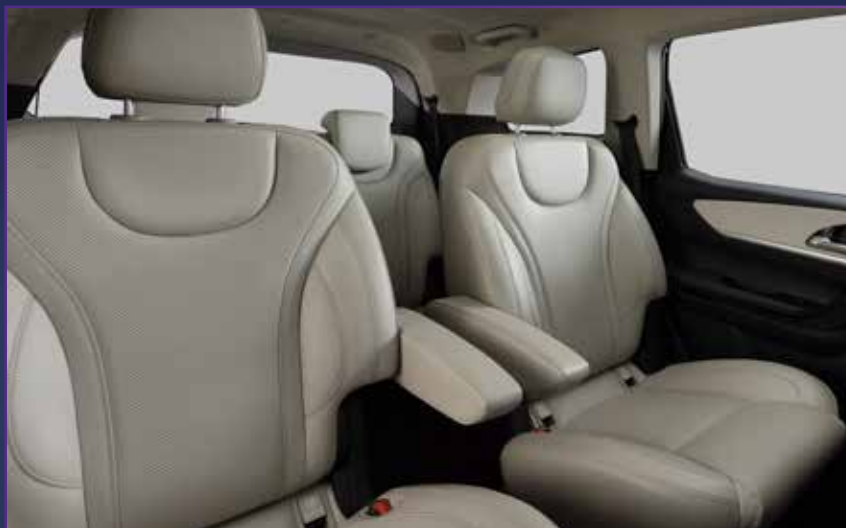
ALL-NEW 2 ND ROW CAPTAIN SEATS

Sitting in the 2024 XUV700 is a treat to all your senses. The ventilated front seats, ensure you're comfortable, even when the outside isn't. And the 2nd row captain seats give you that feeling of flying first-class, in the backseat of your SUV.