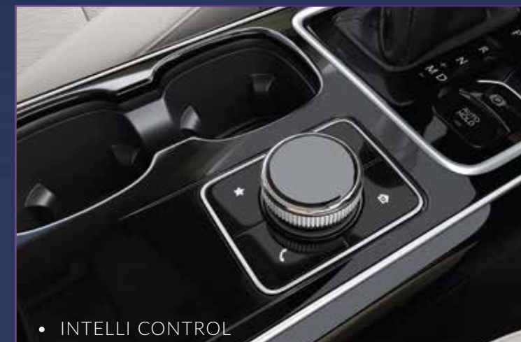
• INTELLI CONTROL

Developed in partnership with SONY Corporation, Japan, this immersive first-in-segment 12 speaker and 3D sound system is designed to take your listening experience to a whole new level.