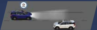
HIGH BEAM ASSIST