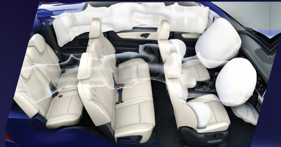
BEST-IN-CLASS 7 AIRBAG SAFETY