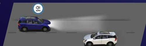
HIGH BEAM ASSIST