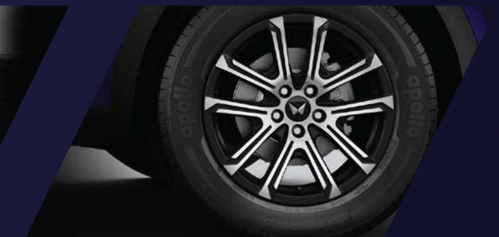
R18 DIAMOND-CUT ALLOY WHEELS