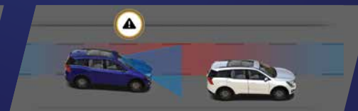
LANE DEPARTURE WARNING