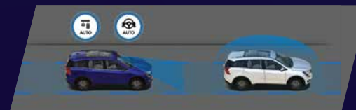
SMART PILOT ASSIST

HERE'S HOW ADAS PROTECTS YOUR XUV700 ON EVERY DRIVE: