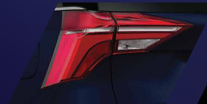
CAPTIVATING ARROW-HEAD LED TAILLAMPS