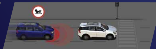
AUTOMATIC EMERGENCY BRAKING