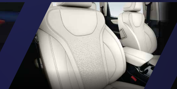
PLUSH LEATHERETTE SEATS