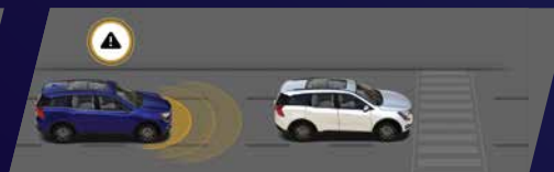
FORWARD COLLISION WARNING