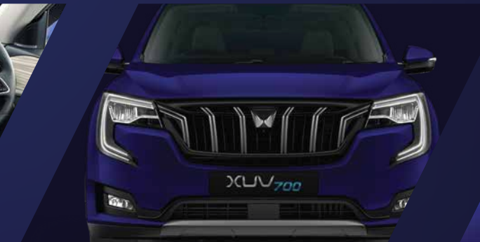
STRIKING CLEAR-VIEW LED HEADLAMPS WITH DRL AND SEQUENTIAL TURN INDICATOR