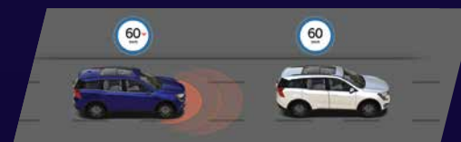
ADAPTIVE CRUISE CONTROL