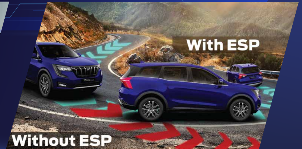
LATEST-GEN ELECTRONIC STABILITY PROGRAM

DRIVER DROWSINESS DETECTION • AUTO BOOSTER HEADLAMPS • PERSONALIZED SAFETY ALERTS • ELECTRONIC PARK BRAKE