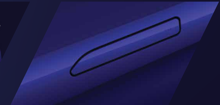
SMART DOOR HANDLES