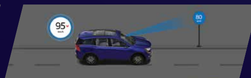
TRAFFIC SIGN RECOGNITION