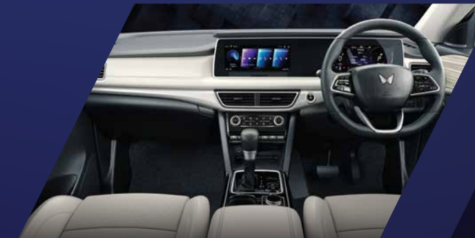
LUXURIOUS AND SOPHISTICATED INTERIORS

With the expansive Skyroof™ in the Mahindra XUV700, panoramic views are the new default. Blazing sunsets or sparkling city lights. Now bring your love for the outside, inside with every drive.