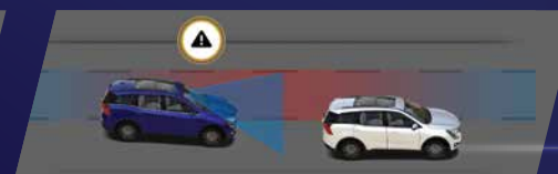
LANE KEEP ASSIST