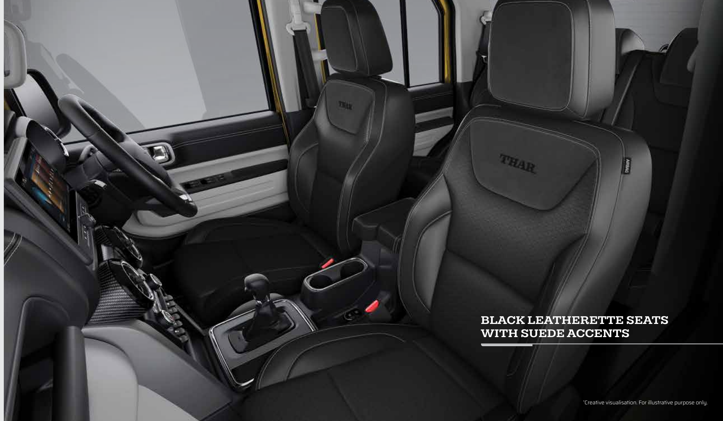
BLACK LEATHERETTE SEATS WITH SUEDE ACCENTS