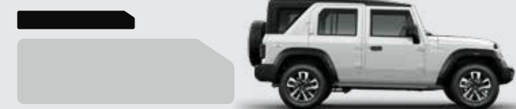
Everest White Black