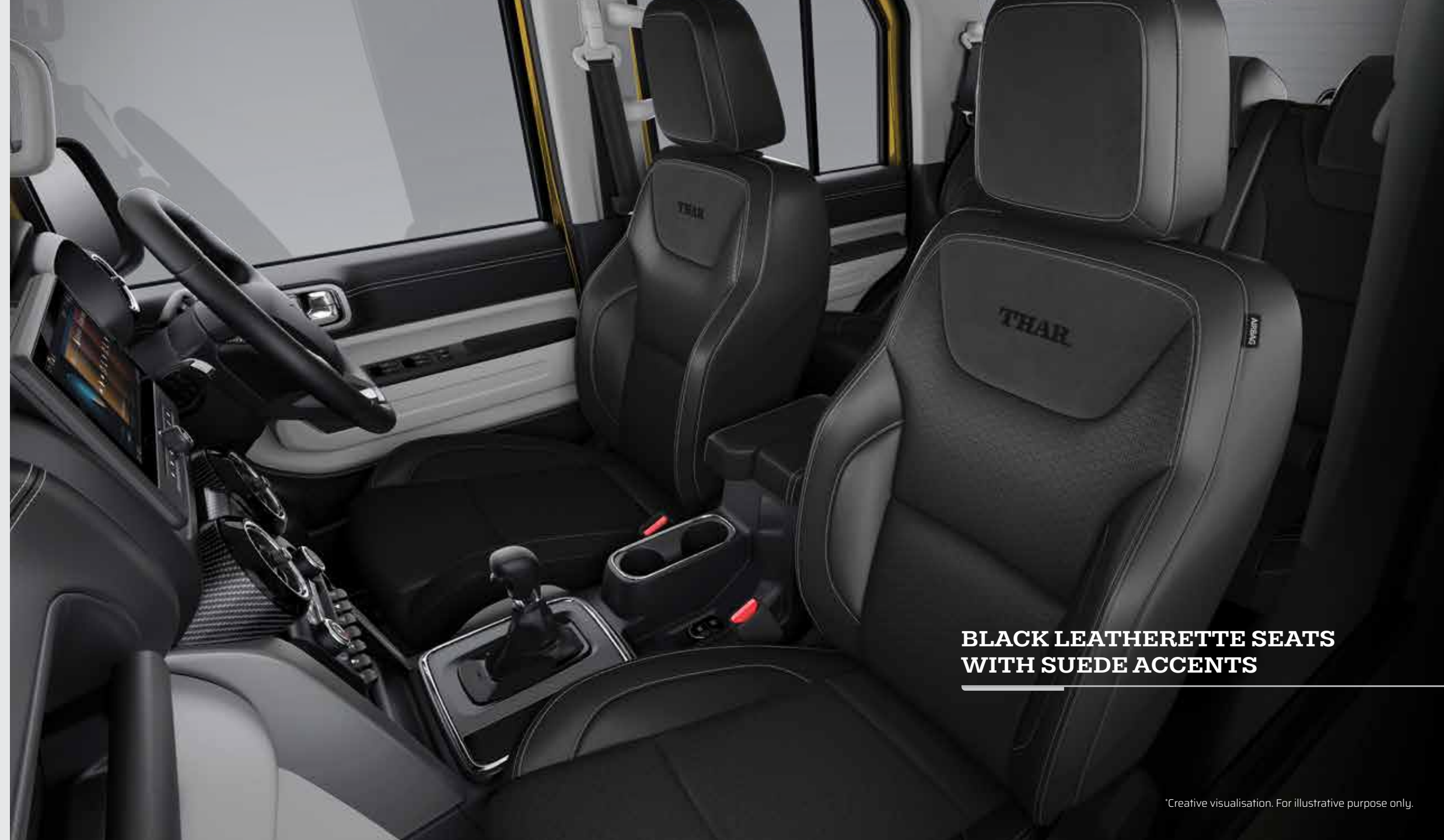
BLACK LEATHERETTE SEATS WITH SUEDE ACCENTS