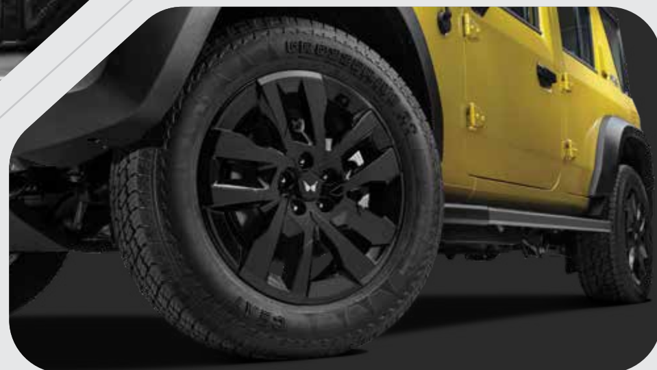
PIANO BLACK FINISH ALLOY WHEELS