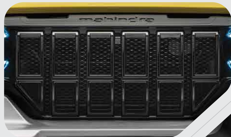
PIANO BLACK GRILLE