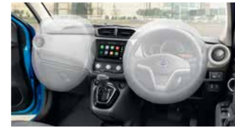
Dual Front Airbags

SAFE Make every drive a safe drive. The Datsun GO+ CVT is packed with next-generation safety features.