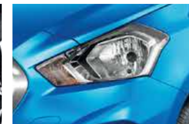
Headlamps with Follow-Me-Home Feature