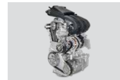
Powerful 1.2L Engine

SURE Tried and tested Japanese Engineering.