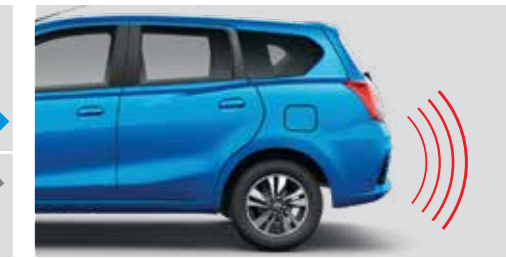
Reverse Parking Sensor

SMART We know what you need in your car. And have designed it accordingly.