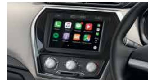
17.64cm (7.0) Touchscreen with Advanced Infotainment System

SMART We know what you need in your car. And have designed it accordingly.