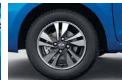
Diamond-Cut R14 Alloys