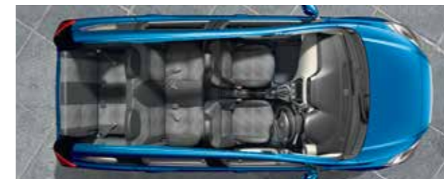
5+2 Flexi Seating

SPACE Designed to maximize comfort while reducing fatigue.