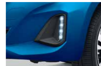
Stylish LED DRLs

STYLE Turn heads on the road with a dazzling range of new generation features.