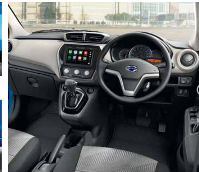
Dual Tone Premium Interiors