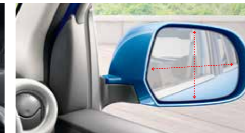
Electric Adjustable ORVMs