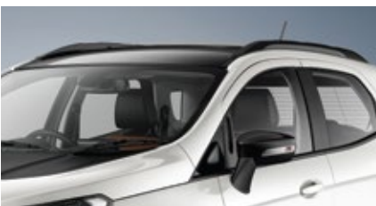
Electric Sunroof with Black Roof Rails