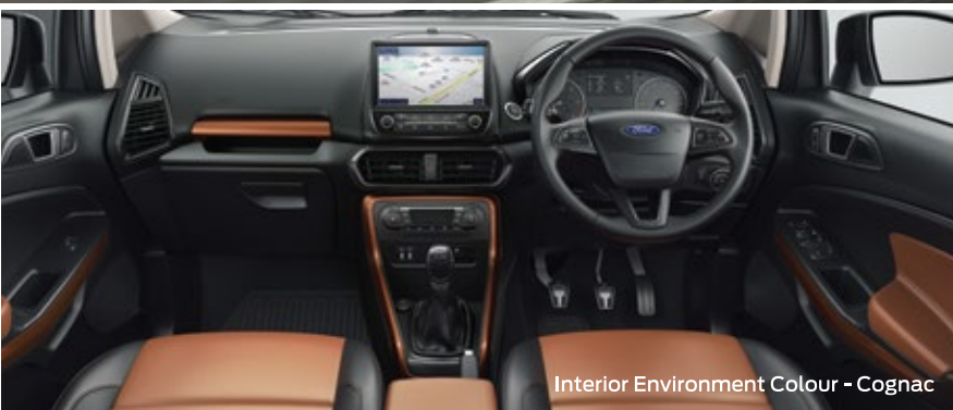
Interior Environment Colour - Cognac