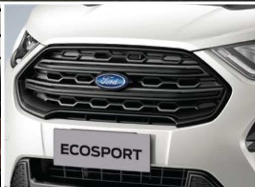
Bold Black Front Grille