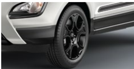
R17 (205/50 R17) Sporty Alloy Wheels