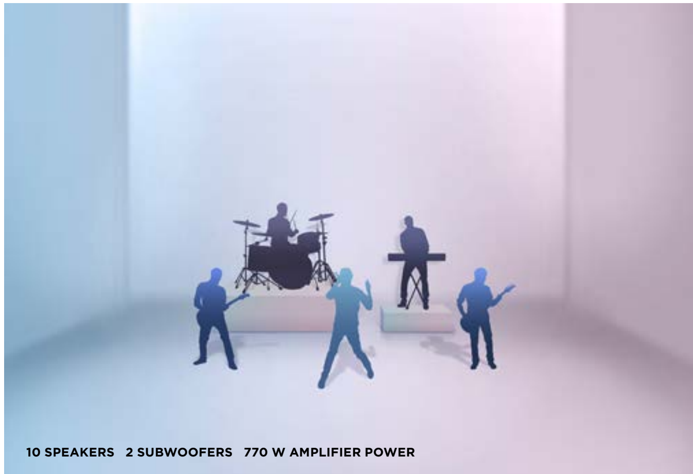
10 SPEAKERS 2 SUBWOOFERS 770 W AMPLIFIER POWER

Brings detail and clarity to everyone in the car with strategically arranged speakers and a dual-channel subwoofer to deliver a full, sophisticated sound.