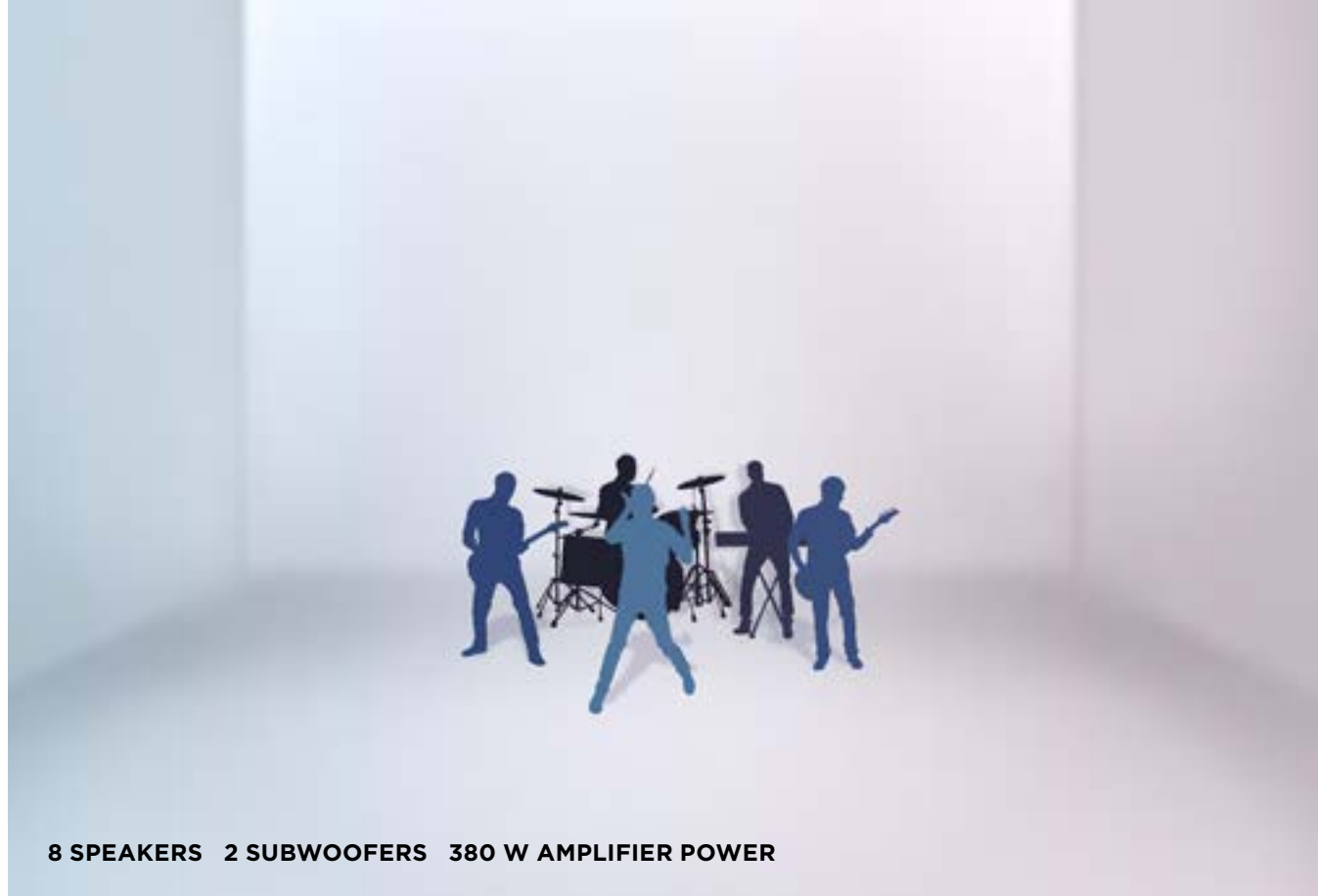
8 SPEAKERS 2 SUBWOOFERS 380 W AMPLIFIER POWER