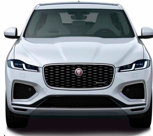
1 640.2 mm (1 648.3 mm on SVR)

Kerb-to-kerb 11.93 m (12.01 m on SVR) Wall-to-wall 12.2 m (12.29 m on SVR) Turns lock-to-lock 2.52