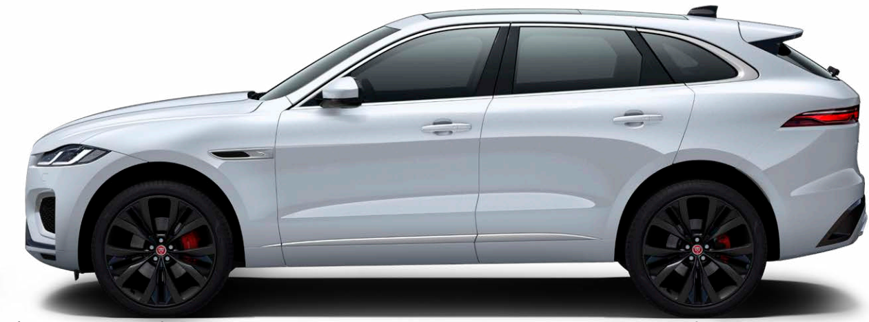
2 874 mm 4 747 mm (4 762 mm on SVR)