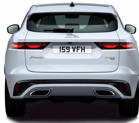
1 655.7 mm (1 665.9 mm on SVR)