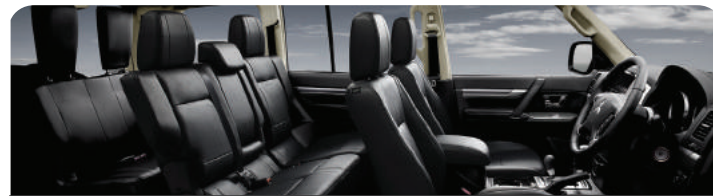
Power assisted seats (driver & passenger)