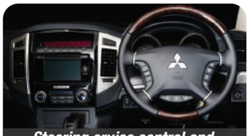
Steering cruise control and audio control