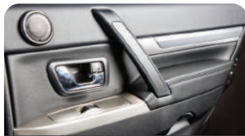
Chrome inner door handles