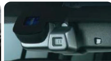
Windshield rain sensor