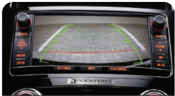
Rockford entertainment system