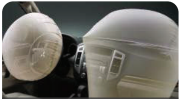
Dual stage SRS air bags