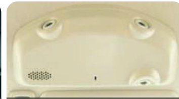
Premium security alarm system