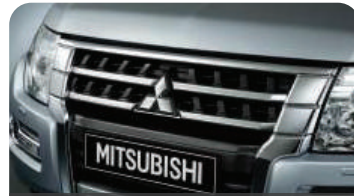
Chrome front grille