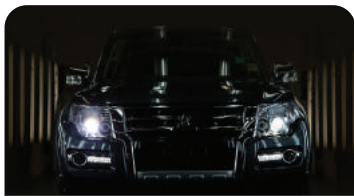
Daytime running LED