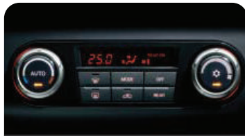
Fully automatic air conditioner