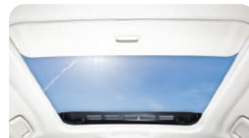
Power tilt & sliding sunroof