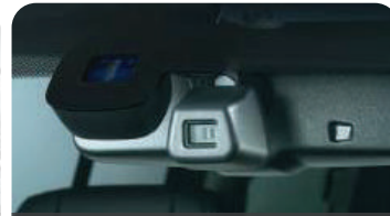
Auto high beam controller