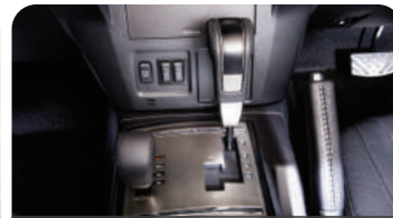
5 Speed AT 4WD sports mode