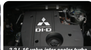
3.2 L 16 valve inter cooler turbo charger engine