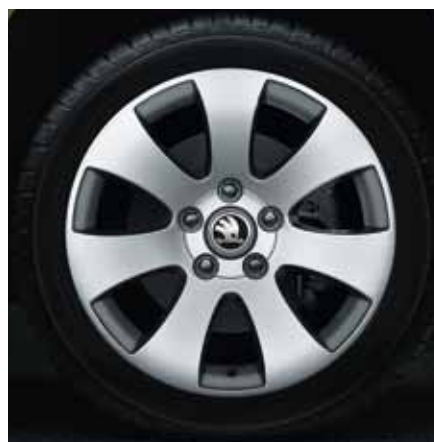
Alloy wheel 7.0J x 16 Spectrum for tyre 205/55 R16 in silver design (3T0 071 496 7ZS)