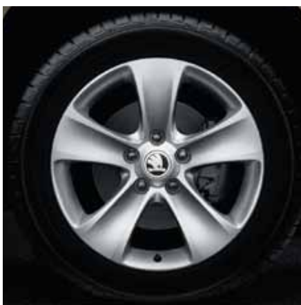
Alloy wheel 7.0J x 16 Moon for tyre 205/55 R16 in silver design (3T0 071 496A 7ZS)