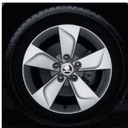
Alloy wheel 7.0J x 16 Nevis for tyre 205/55 R16 in silver design (5L0 071 496A 8Z8)