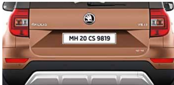
16, Forest (4x4)