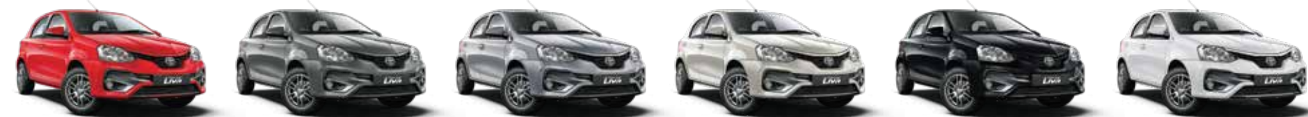
VERMILION RED CLASSIC GREY SILVER MICA METALLIC HARMONY BEIGE CELESTIAL BLACK WHITE

*As certified by Test Agency under Rule 115 of CMVR, 1989 under standard test conditions. The values obtained by users will differ from this value due to infinite variables such as driving habits, road and traffic conditions, fuel quality, maintenance practices, loading pattern, ambient conditions, usual engineering tolerances on components and so on. **Bluetooth is a registered trademark of Bluetooth SIG. - For more details on the functioning of airbags, please refer to the owner's manual.