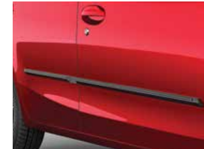
SIDE PROTECTION MOULD