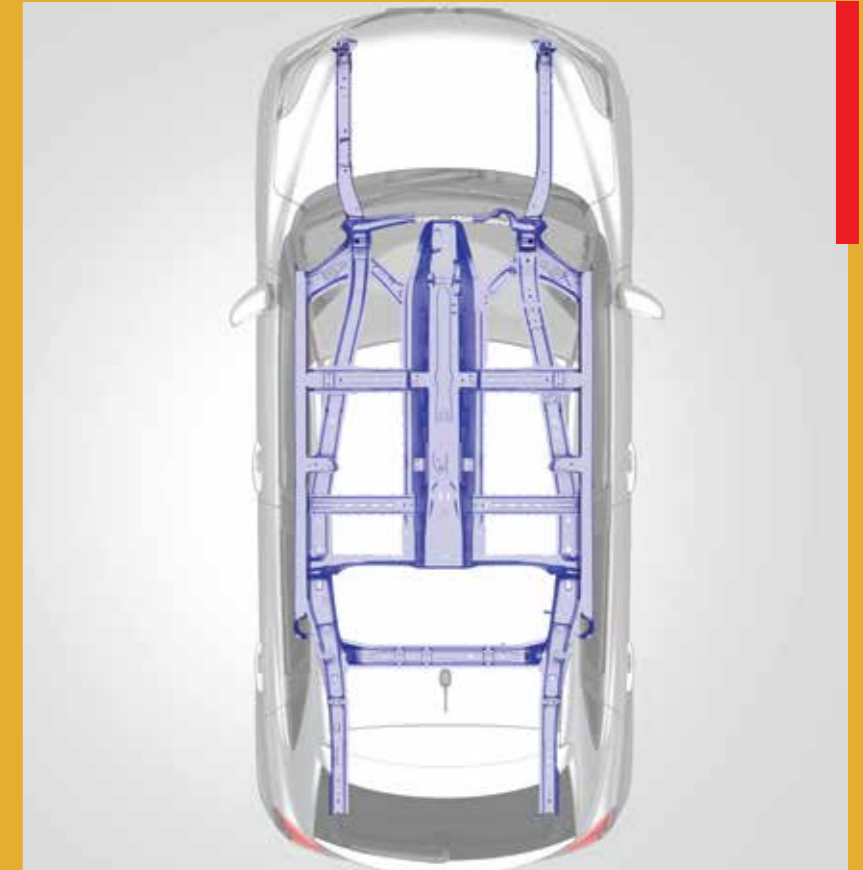
New Generation HEARTECT Platform - An innovative new platform designed to ensure superior crash resiliency, enhanced rigidity and improved NVH (Noise Vibration and Harshness) performance