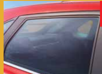
UV PROTECT GLASS Protection from Harmful UV Rays

Experience a suite of intuitive features and intelligent design that come together with unmatched comfort to make hatchin' an absolute pleasure.