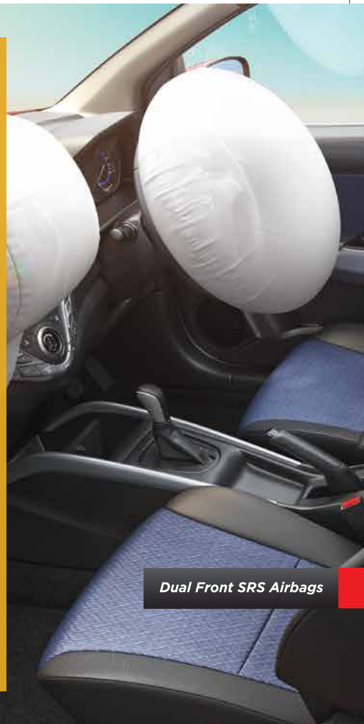
Dual Front SRS Airbags