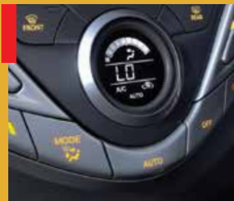
Auto AC that automatically adjusts the cabin temperature to your liking