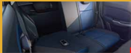
60:40 Split Seat for ample rear room