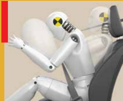
Front Seatbelts with PT/FL - to reduce impact to the chest and provide excellent occupant protection in the event of a collision

Built with high tensile steel for enhanced safety, the new Toyota Glanza delivers utmost confidence by making sure all occupants are protected by a complete package of active and passive safety features.