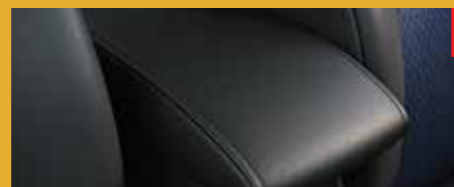
Front Armrest with Storage