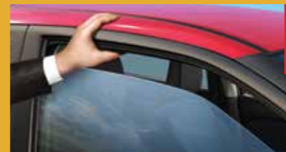
Anti-pinch Driver Power Window