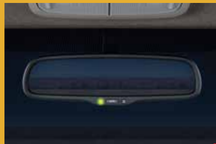
Electro-chromic IRVM adjusts light intensity, ensuring safer drive.