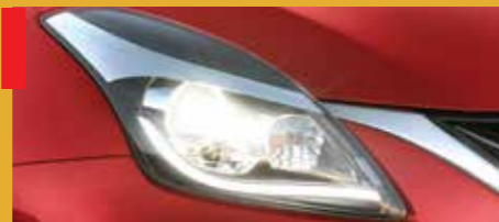
Auto Headlamps with light sensing capability