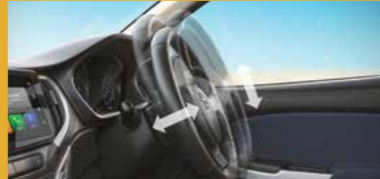
Tilt & Telescopic Steering with Steering Mounted Controls