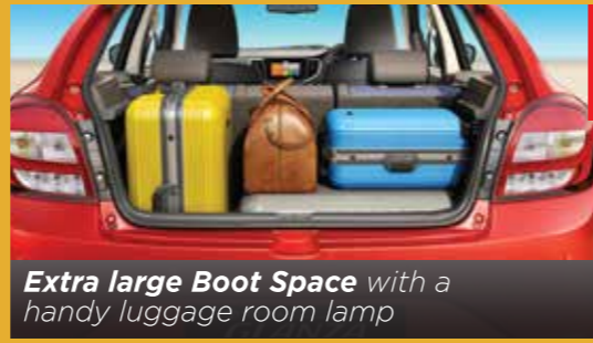
Extra large Boot Space with a handy luggage room lamp