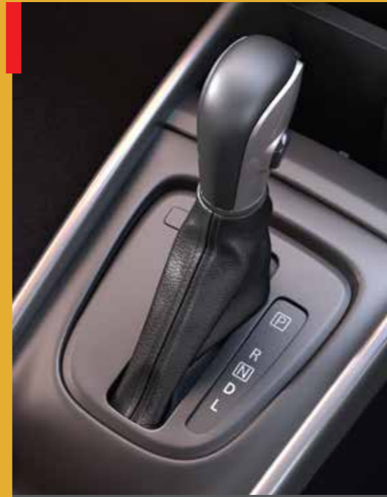
Seamless CVT/MT Transmission

The new Toyota Glanza is equipped with a powerful yet fuel efficient K-series engine that delivers a superior driving experience with exceptional power and low-end torque. Giving you all the thrills and performance you need to make your plans way more exciting.