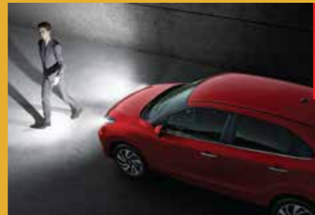
Follow-me-Home Headlamps to assist you in the dark by staying on