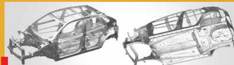
Total Effective Control Technology (TECT) - effectively absorbs and disperses crash energy ensuring increased safety for all occupants