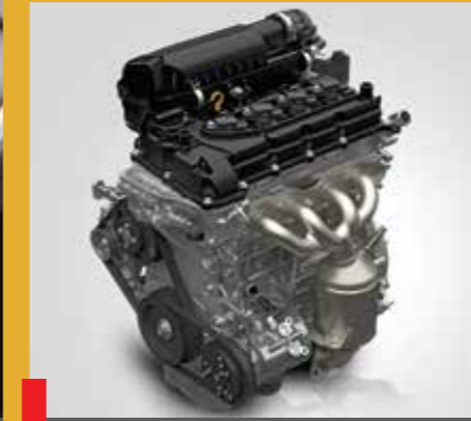
K-series Petrol Engine

The new Toyota Glanza is equipped with a powerful yet fuel efficient K-series engine that delivers a superior driving experience with exceptional power and low-end torque. Giving you all the thrills and performance you need to make your plans way more exciting.