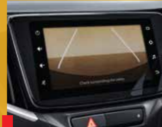
Reverse Parking Camera