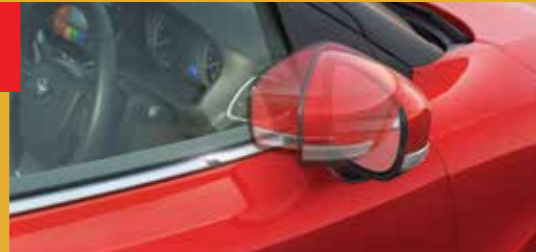
Electric Fold ORVMs with Auto Fold Function