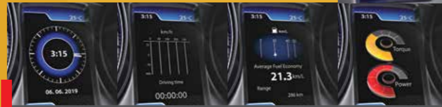
Interactive TFT Multi Info Display